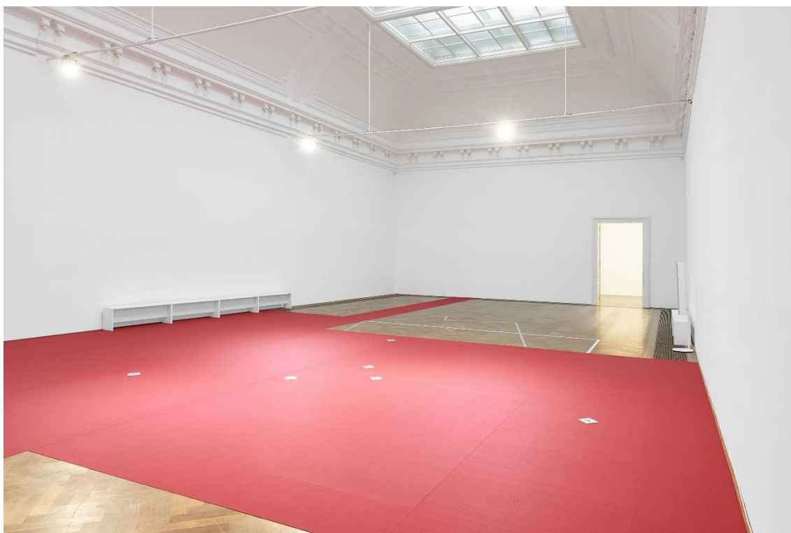
Zhana Ivanova, Installationsansicht, Ongoing Retrospective (Chapter 3) , Kunsthalle Basel, 2018.