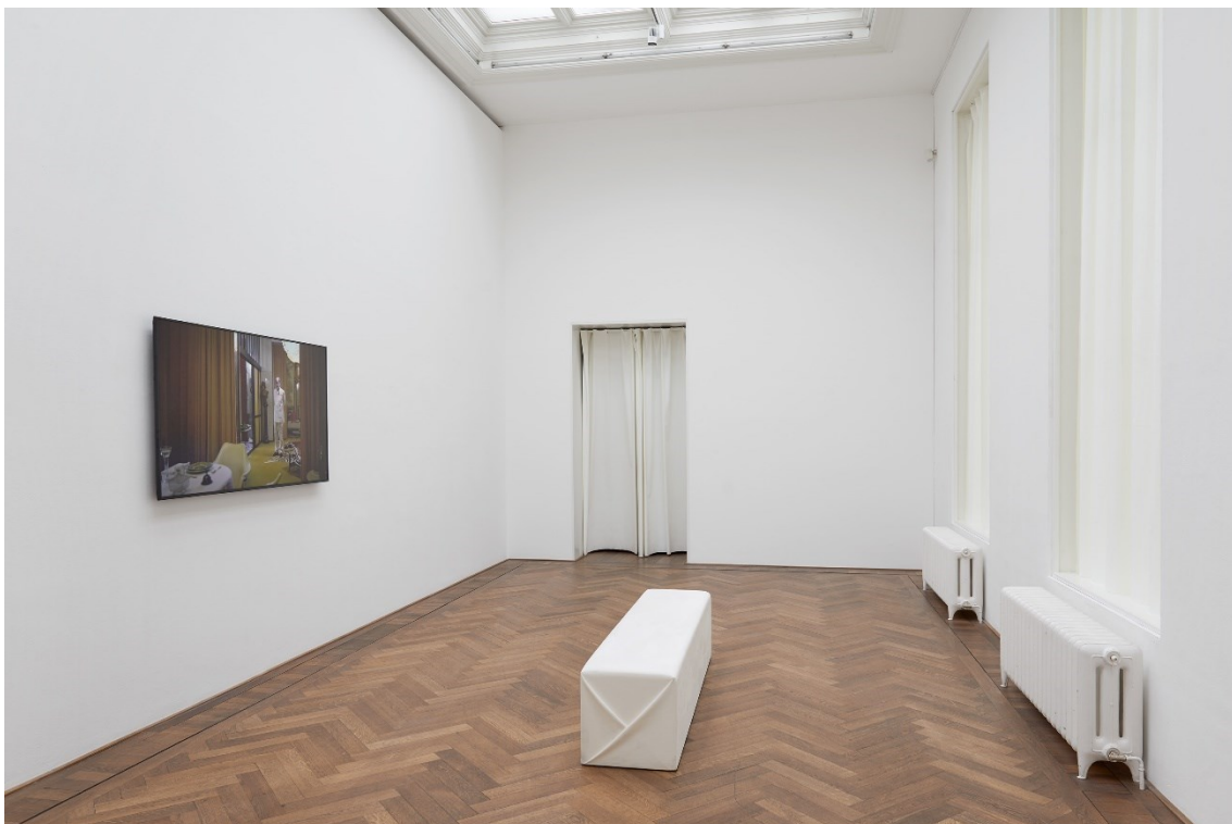
Yuri Ancarani, Installationsansicht, Sculture , Blick auf Séance , 2014, Kunsthalle Basel, 2018.