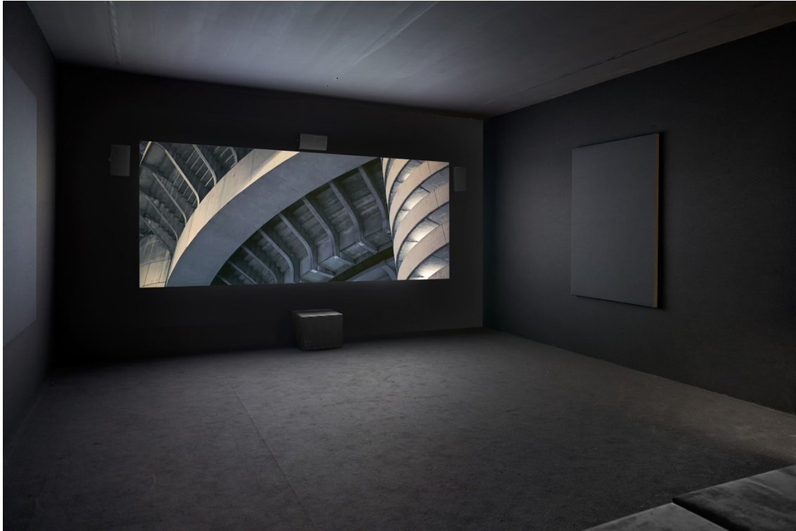
Yuri Ancarani, Installationsansicht, Sculture , Blick auf San Siro , 2014, Kunsthalle Basel, 2018.