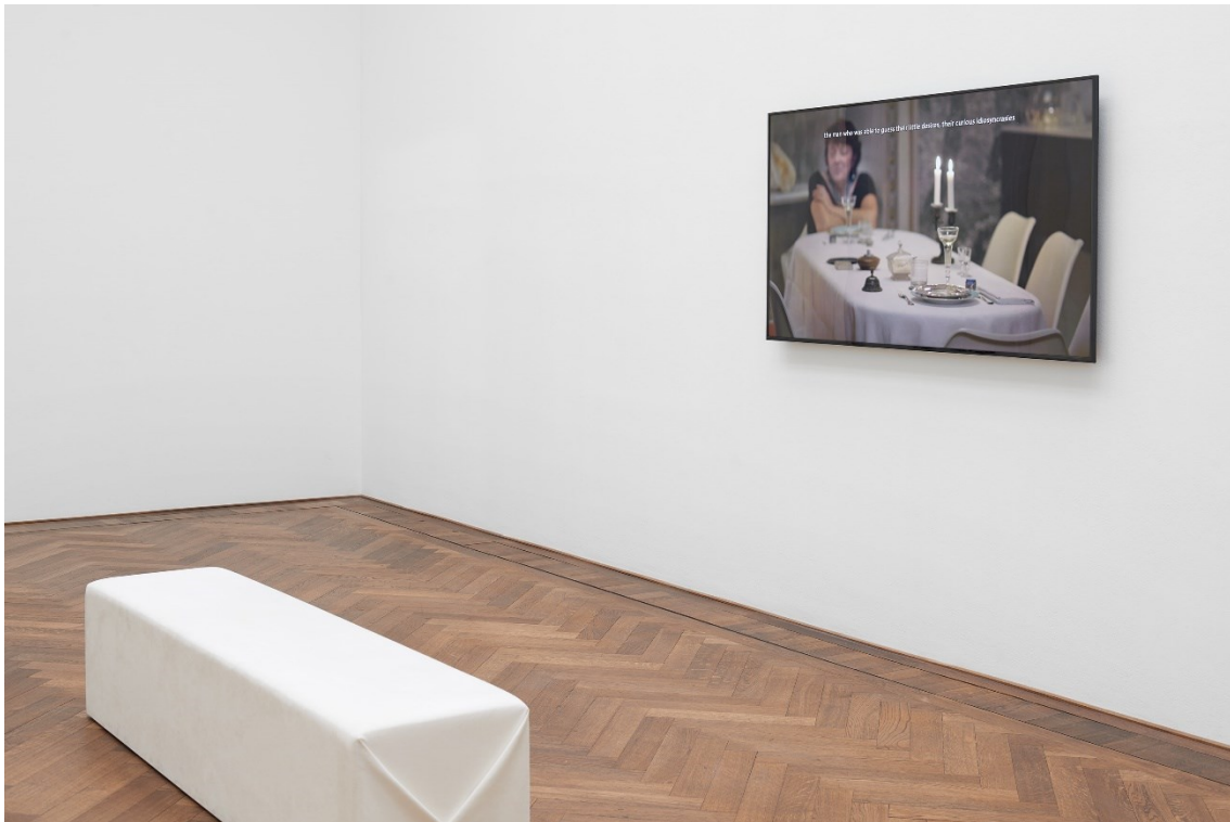
Yuri Ancarani, Installationsansicht, Sculture , Blick auf Séance , 2014, Kunsthalle Basel, 2018.