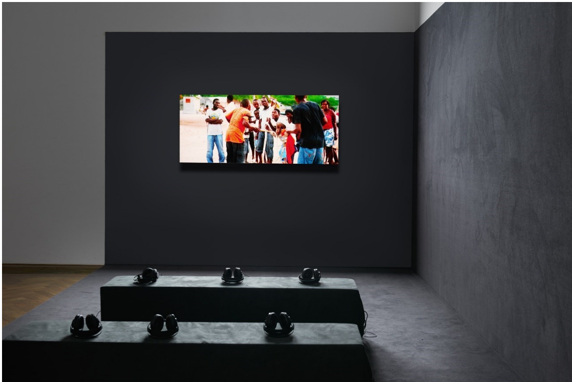
Yuri Ancarani, Installationsansicht, Sculture , Blick auf Whipping Zombie , 2017, Kunsthalle Basel, 2018. Yuri Ancarani, installation view, Sculture , view on Whipping Zombie , 2017, Kunsthalle Basel, 2018.