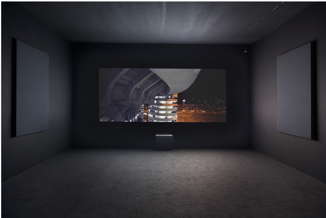
Yuri Ancarani, Installationsansicht, Sculture , Blick auf San Siro , 2014, Kunsthalle Basel, 2018.