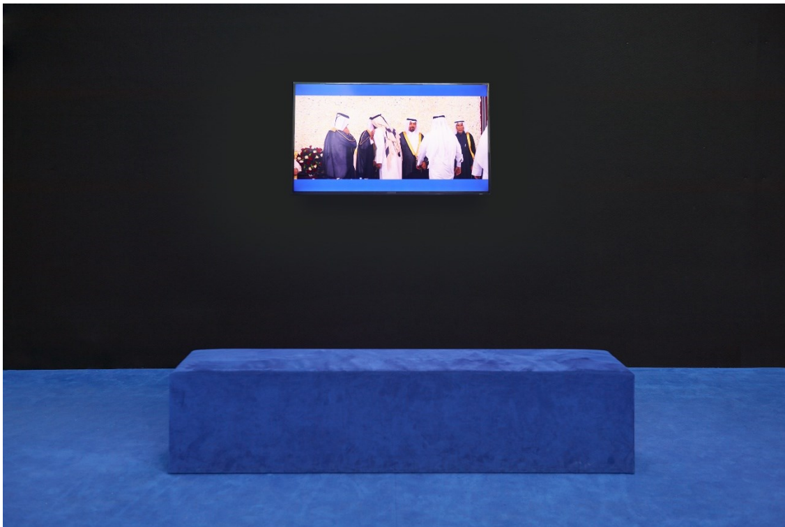
Yuri Ancarani, Installationsansicht, Sculture , Blick auf Wedding , 2016, Kunsthalle Basel, 2018. Yuri Ancarani, installation view, Sculture , view on Wedding , 2016, Kunsthalle Basel, 2018.