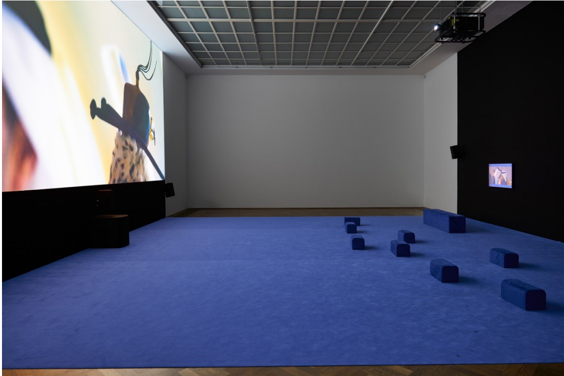
Yuri Ancarani, Installationsansicht, Sculture , Blick auf The Challenge , 2016 (links) und Wedding , 2016 (rechts), Kunsthalle Basel, 2018. Yuri Ancarani, installation view, Sculture , view on The Challenge , 2016 (left) and Wedding , 2016 (right), Kunsthalle Basel, 2018.