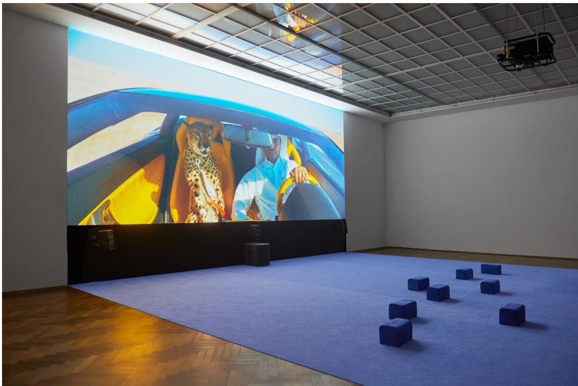
Yuri Ancarani, Installationsansicht, Sculture , Blick auf The Challenge , 2016, Kunsthalle Basel, 2018. Yuri Ancarani, installation view, Sculture , view on The Challenge , 2016, Kunsthalle Basel, 2018.