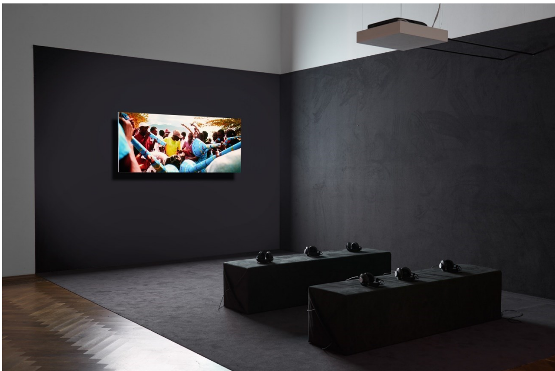
Yuri Ancarani, Installationsansicht, Sculture , Blick auf Whipping Zombie , 2017, Kunsthalle Basel, 2018.