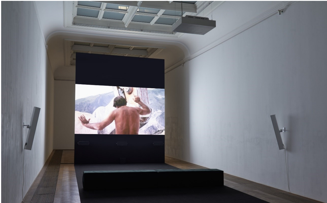
Yuri Ancarani, Installationsansicht, Sculture , Blick auf Il Capo , 2010, Kunsthalle Basel, 2018.

Download-Link kunsthallebasel.ch/presse/