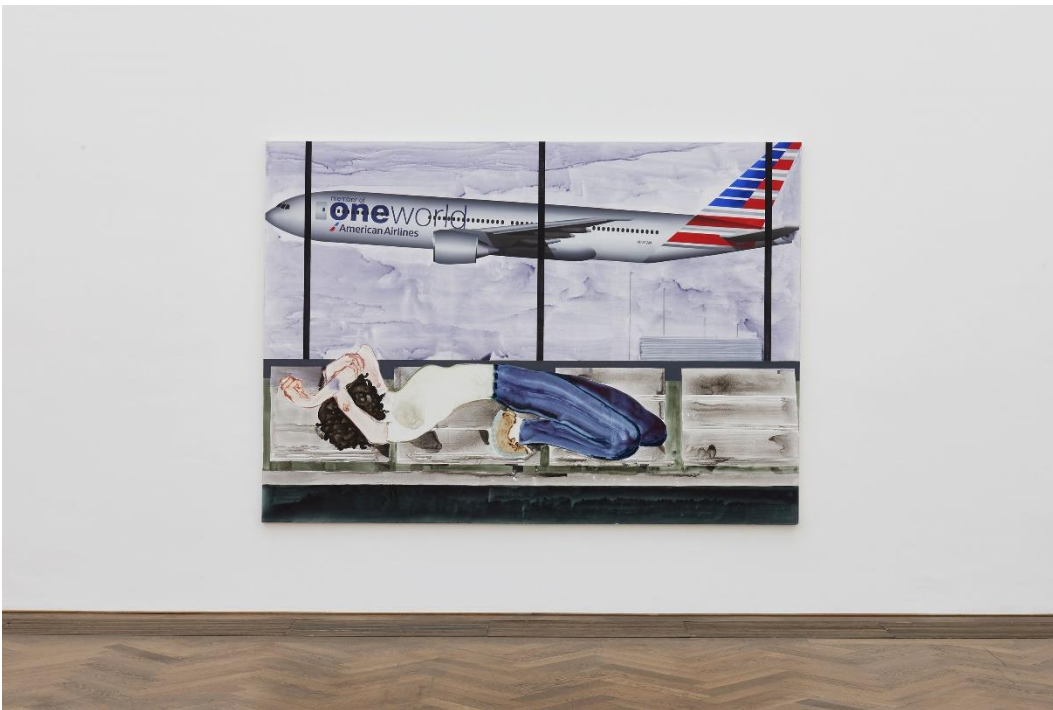
Sanya Kantarovsky, Installationsansicht, Disease of the Eyes , Blick auf One World , 2018, Kunsthalle Basel, 2018.