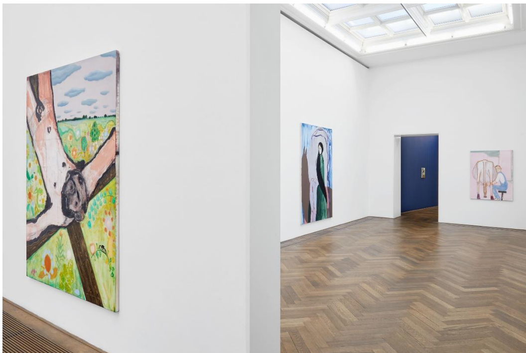
Sanya Kantarovsky, Installationsansicht, Disease of the Eyes , Kunsthalle Basel, 2018. Sanya Kantarovsky, installation view, Disease of the Eyes , Kunsthalle Basel, 2018.