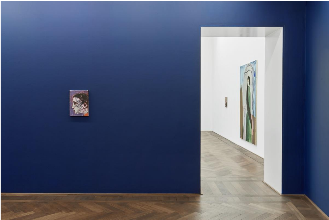
Sanya Kantarovsky, Installationsansicht, Disease of the Eyes , Kunsthalle Basel, 2018. Sanya Kantarovsky, installation view, Disease of the Eyes , Kunsthalle Basel, 2018.