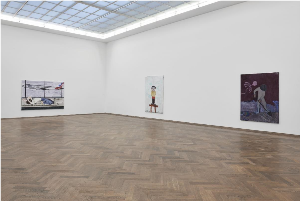
Sanya Kantarovsky, Installationsansicht, Disease of the Eyes , Blick auf (v.l.n.r.) One World , Smear , Petrol , alle 2018, Kunsthalle Basel, 2018.