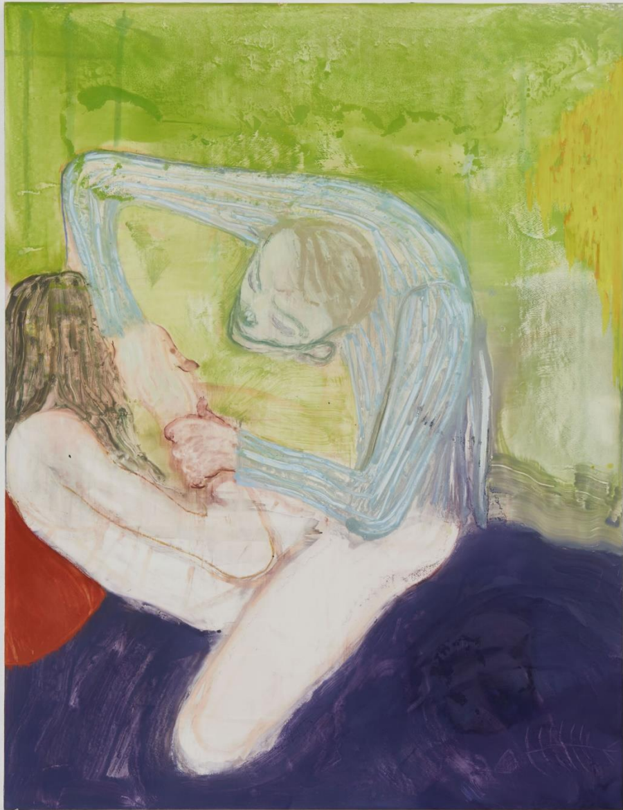
Sanya Kantarovsky, Installationsansicht, Disease of the Eyes , Blick auf Deprivation , 2018, Kunsthalle Basel, 2018. Sanya Kantarovsky, installation view, Disease of the Eyes , view on Deprivation , 2018, Kunsthalle Basel, 2018.