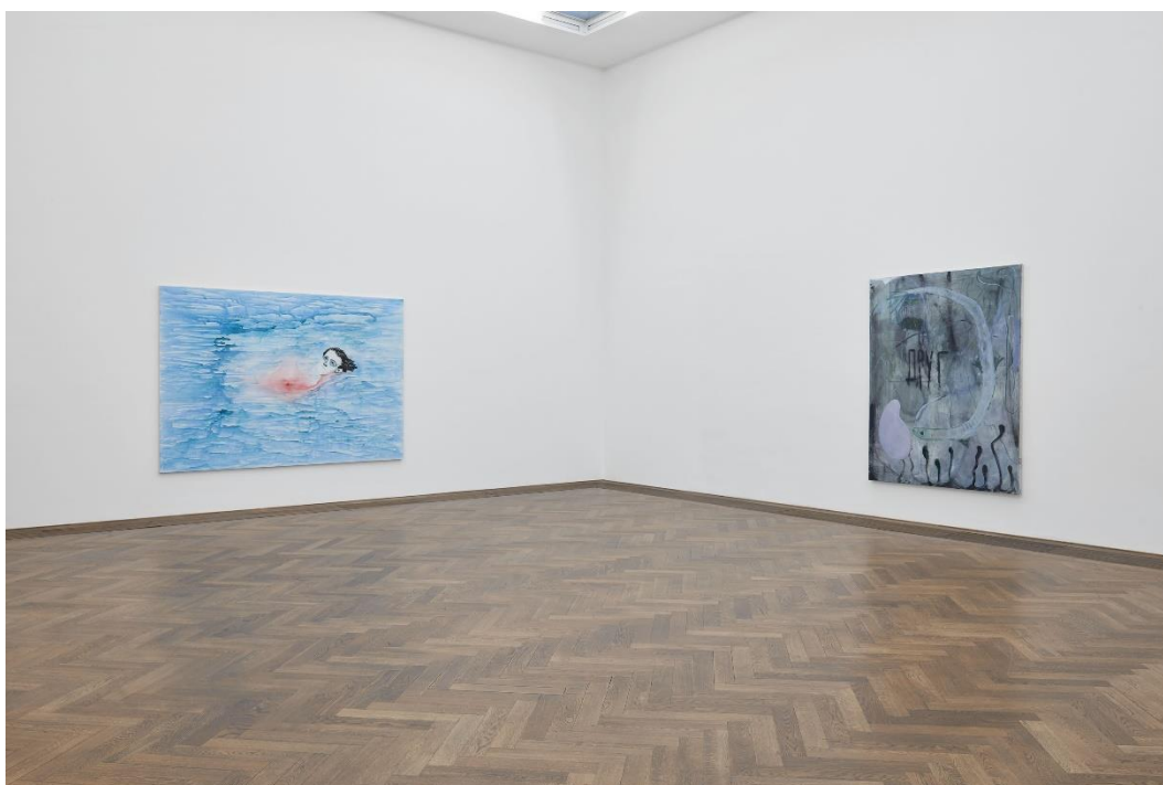
Sanya Kantarovsky, Installationsansicht, Disease of the Eyes , Blick auf (v.l.n.r.) Floater , 2018, Friend , 2018, Kunsthalle Basel, 2018.