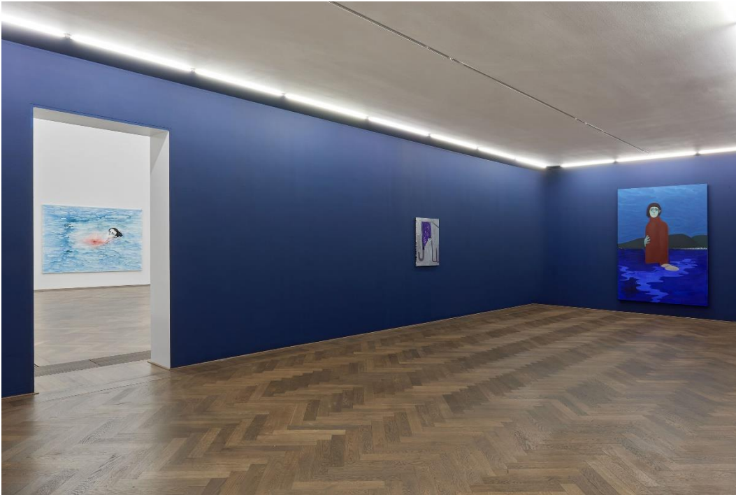
Sanya Kantarovsky, Installationsansicht, Disease of the Eyes , Kunsthalle Basel, 2018. Sanya Kantarovsky, installation view, Disease of the Eyes , Kunsthalle Basel, 2018.