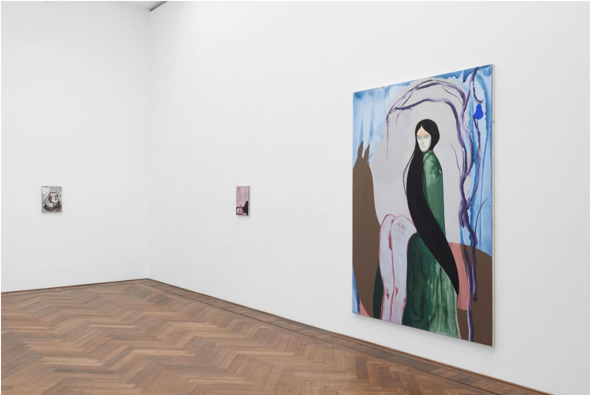
Sanya Kantarovsky, Installationsansicht, Disease of the Eyes , Blick auf (v.l.n.r.) Zontik , Wavy Head , Documents , alle 2018, Kunsthalle Basel, 2018. Sanya Kantarovsky, installation view, Disease of the Eyes , view on (f.l.t.r.) Zontik , Wavy Head , Documents , all 2018, Kunsthalle Basel, 2018.