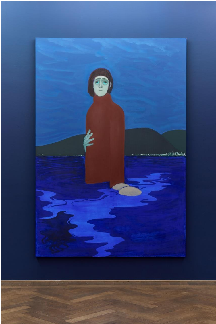
Sanya Kantarovsky, Installationsansicht, Disease of the Eyes , Blick auf, Seizure , 2018, Kunsthalle Basel, 2018. Sanya Kantarovsky, installation view, Disease of the Eyes , view on, Seizure , 2018, Kunsthalle Basel, 2018.