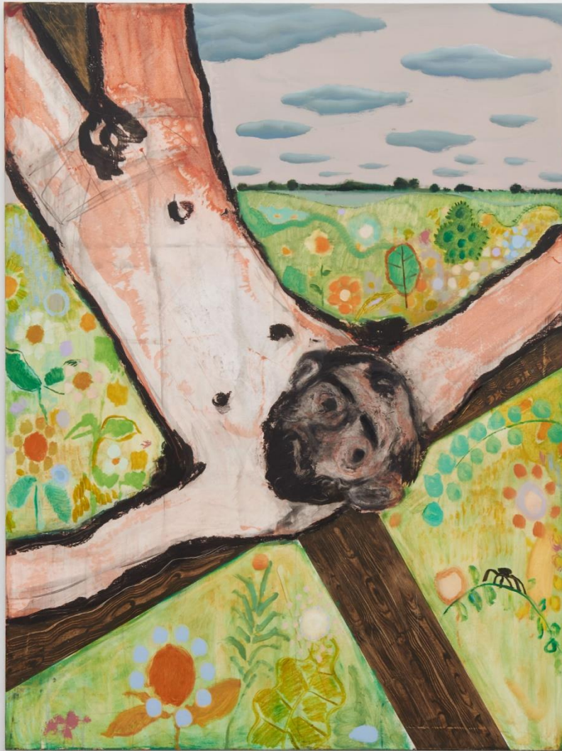
Sanya Kantarovsky, Installationsansicht, Disease of the Eyes , Blick auf Peter , 2018, Kunsthalle Basel, 2018. Sanya Kantarovsky, installation view, Disease of the Eyes , view on Peter , 2018, Kunsthalle Basel, 2018.