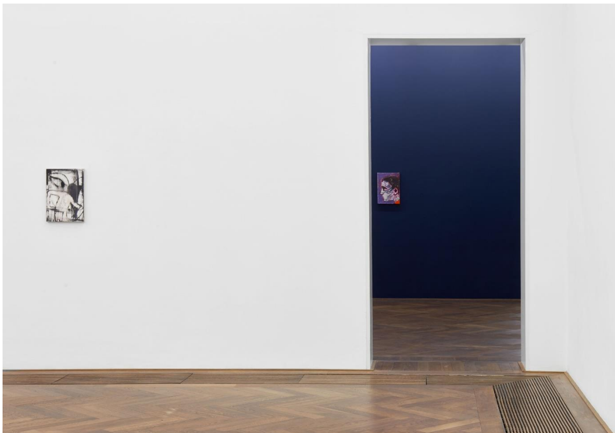
Sanya Kantarovsky, Installationsansicht, Disease of the Eyes , Blick auf (v.l.n.r.) Snails und Bonehead , beide 2018, Kunsthalle Basel, 2018.