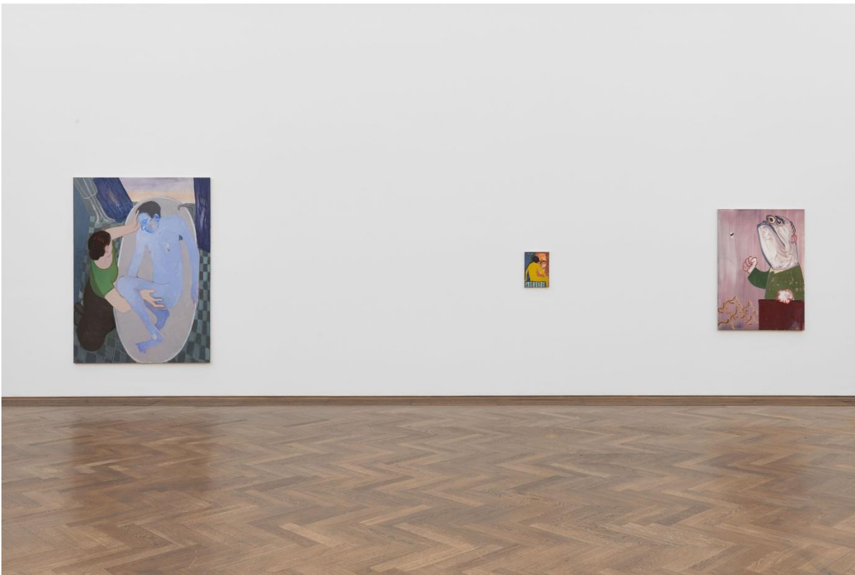
Sanya Kantarovsky, Installationsansicht, Disease of the Eyes , Blick auf (v.l.n.r.), Alma , Banana , Enlightened SelfInterest , alle 2018, Kunsthalle Basel, 2018.