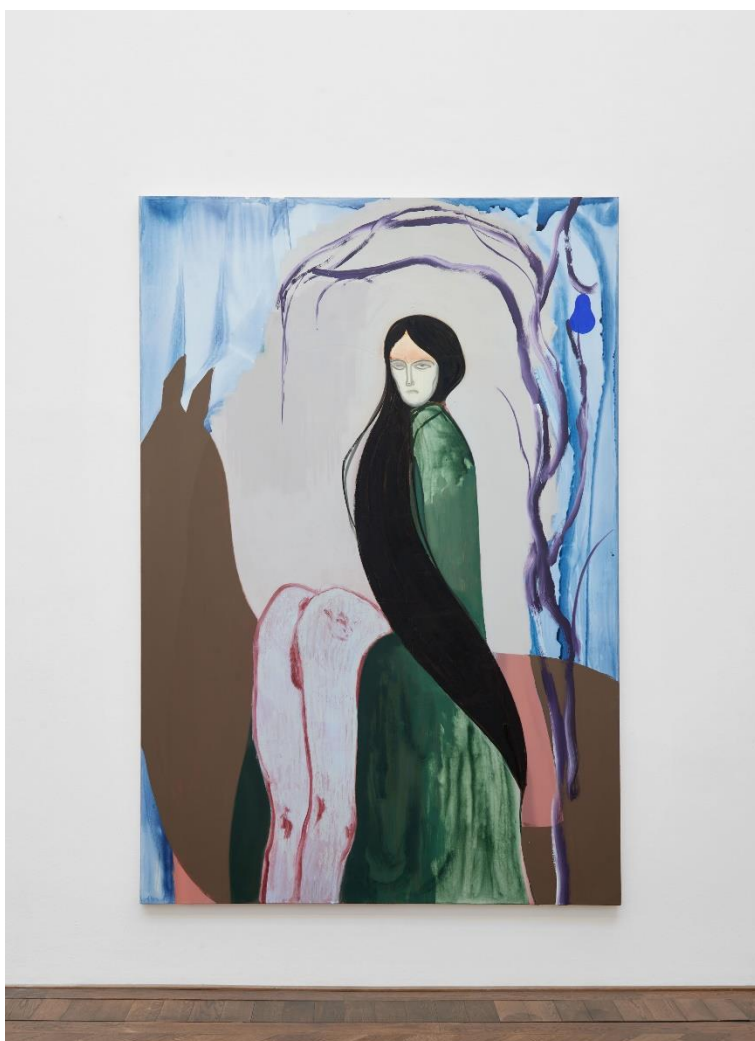
Sanya Kantarovsky, Installationsansicht, Disease of the Eyes , Blick auf Documents , 2018, Kunsthalle Basel, 2018. Sanya Kantarovsky, installation view, Disease of the Eyes , view on Documents , 2018, Kunsthalle Basel, 2018.