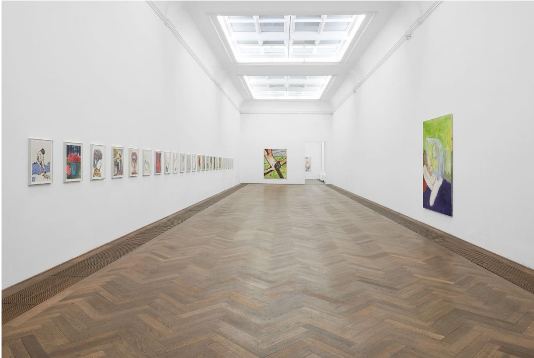
Sanya Kantarovsky, Installationsansicht, Disease of the Eyes , Kunsthalle Basel, 2018. Sanya Kantarovsky, installation view, Disease of the Eyes , Kunsthalle Basel, 2018.

Download-Link: kunsthallebasel.ch/presse/