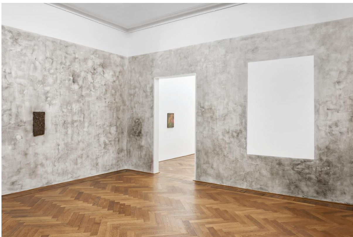
Tania Pérez Córdova, Installationsansicht, Daylength of a room , Kunsthalle Basel, 2018. Tania Pérez Córdova, installation view, Daylength of a room , Kunsthalle Basel, 2018.