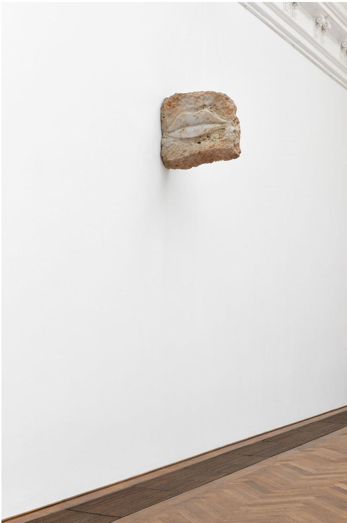
Tania Pérez Córdova, Installationsansicht, Daylength of a room , Blick auf, Woman next to a still-life , 2018, Kunsthalle Basel, 2018. Tania Pérez Córdova, installation view, Daylength of a room , view on, Woman next to a still-life , 2018, Kunsthalle Basel, 2018.