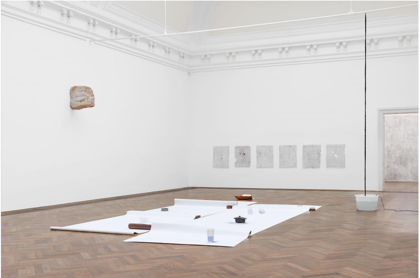
Tania Pérez Córdova, Installationsansicht, Daylength of a room , Kunsthalle Basel, 2018. Tania Pérez Córdova, installation view, Daylength of a room , Kunsthalle Basel, 2018.

Download-Link: kunsthallebasel.ch/presse/