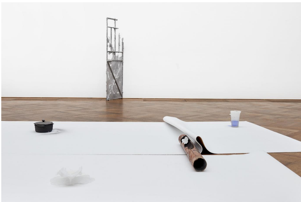
Tania Pérez Córdova, Installationsansicht, Daylength of a room , Kunsthalle Basel, 2018. Tania Pérez Córdova, installation view, Daylength of a room , Kunsthalle Basel, 2018.