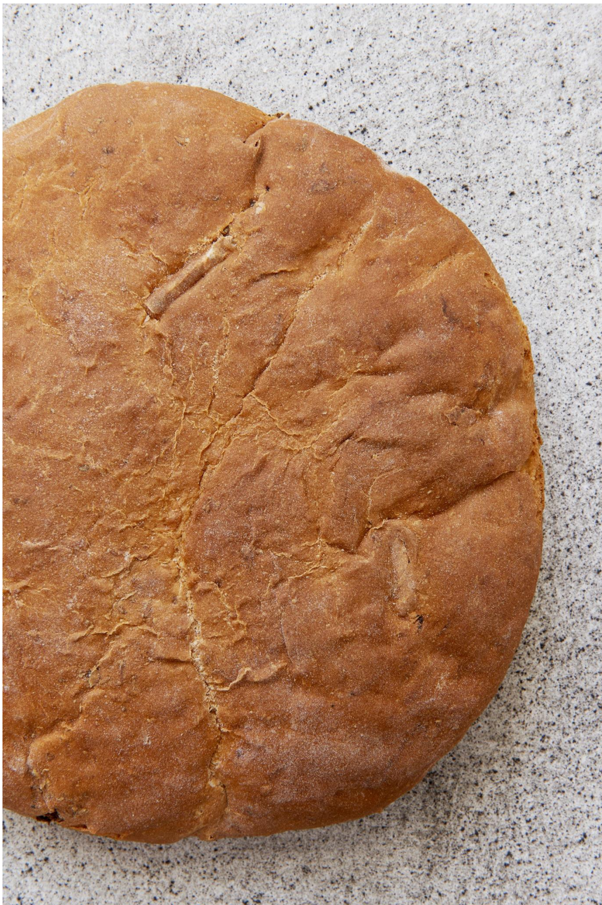
Tania Pérez Córdova, Installationsansicht, Daylength of a room , Blick auf, Strike , 2018, Kunsthalle Basel, 2018. Tania Pérez Córdova, installation view, Daylength of a room , view on, Strike , 2018, Kunsthalle Basel, 2018.