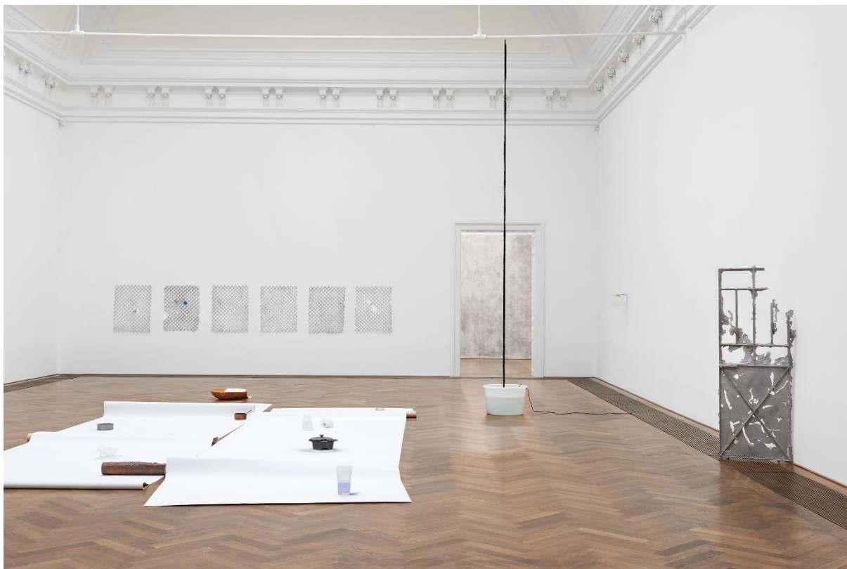
Tania Pérez Córdova, Installationsansicht, Daylength of a room , Kunsthalle Basel, 2018. Tania Pérez Córdova, installation view, Daylength of a room , Kunsthalle Basel, 2018.