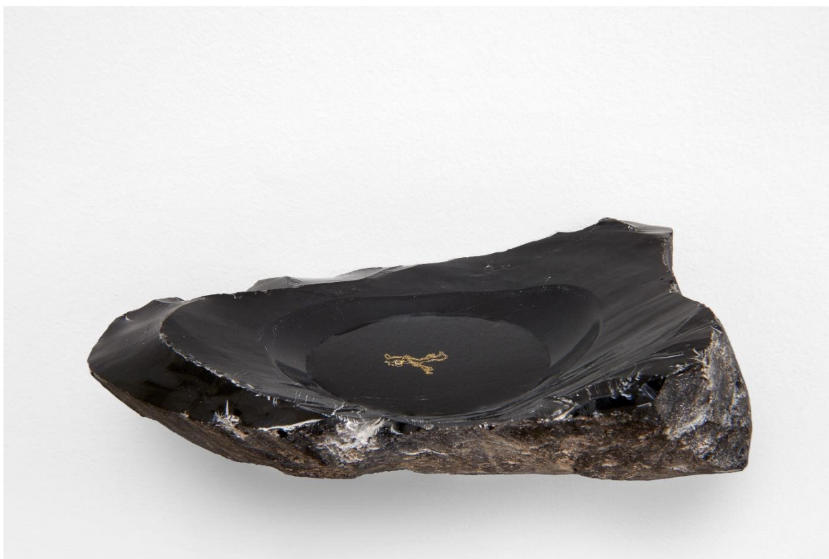
Tania Pérez Córdova, Installationsansicht, Daylength of a room , Blick auf, Sincere / Non-sincere , 2018, Kunsthalle Basel, 2018. Tania Pérez Córdova, installation view, Daylength of a room , view on, Sincere / Non-sincere , 2018, Kunsthalle Basel, 2018.