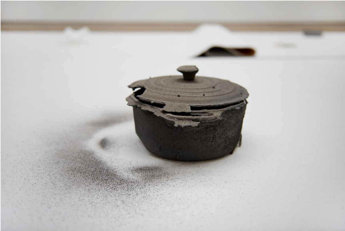
Tania Pérez Córdova, Installationsansicht, Daylength of a room , Blick auf, Stuttering , 2018 (Detail), Kunsthalle Basel, 2018.