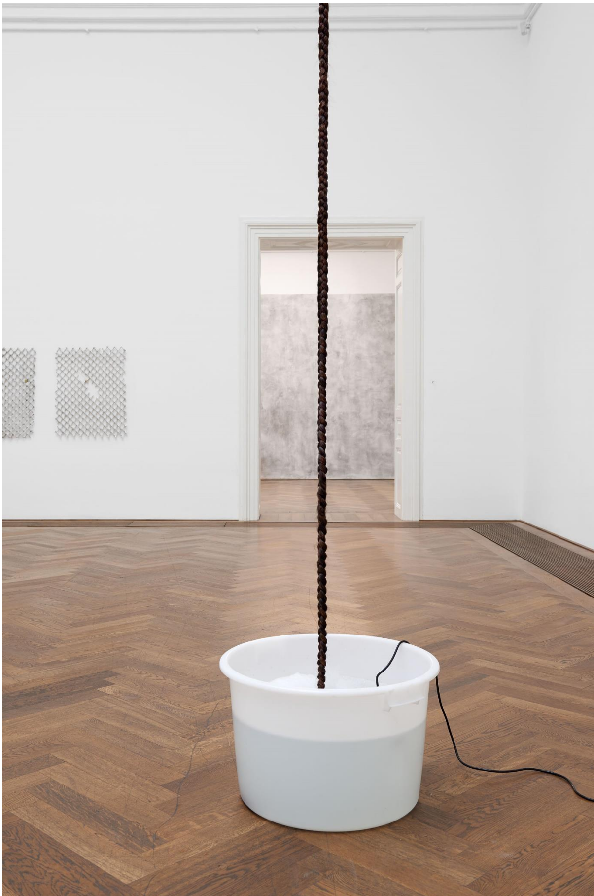
Tania Pérez Córdova, Installationsansicht, Daylength of a room , Blick auf, Figure standing next to a fountain , 2018, Kunsthalle Basel, 2018. Tania Pérez Córdova, installation view, Daylength of a room , view on, Figure standing next to a fountain , 2018, Kunsthalle Basel, 2018.