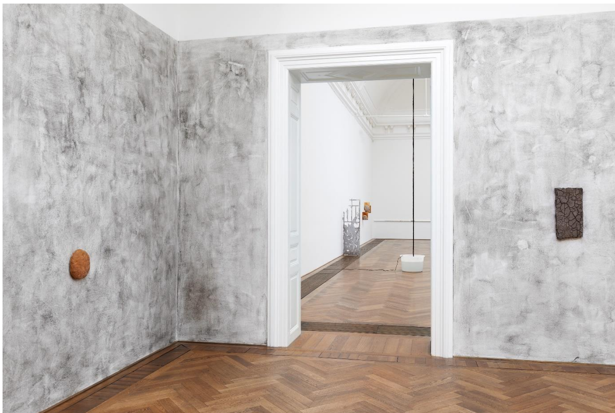
Tania Pérez Córdova, Installationsansicht, Daylength of a room , Kunsthalle Basel, 2018. Tania Pérez Córdova, installation view, Daylength of a room , Kunsthalle Basel, 2018.