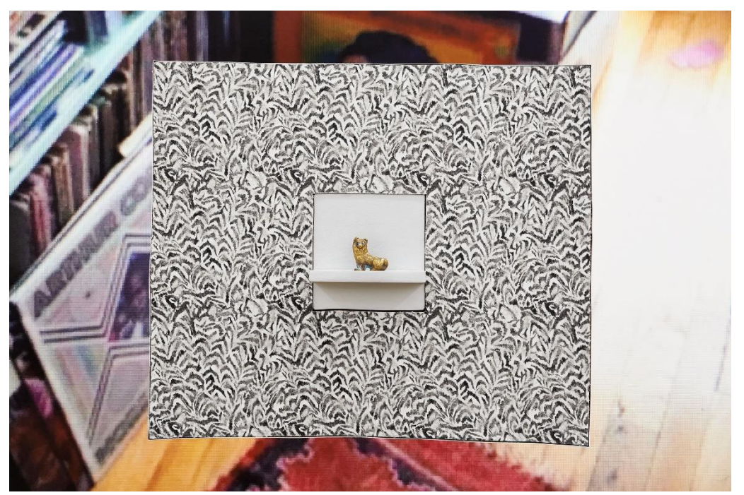
Sadie Benning, Bedroom , 2016 (Detail). Foto: Philipp Hänger / Sadie Benning, Bedroom , 2016 (detail). Photo: Philipp Hänger