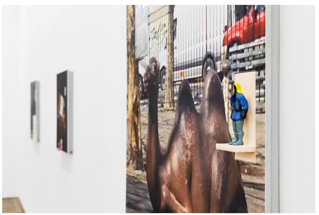
Sadie Benning, Installationsansicht Shared Eye , Kunsthalle Basel, 2017. Foto: Philipp Hänger / Sadie Benning, installation view Shared Eye , Kunsthalle Basel, 2017. Photo: Philipp Hänger