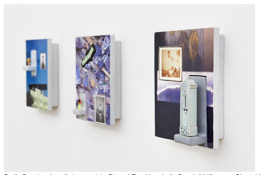
Sadie Benning, Installationsansicht Shared Eye , Kunsthalle Basel, 2017, vorne Shared Eye ( Sequence 1, Panel 1 ), 2016.  / Sadie Benning, installation view Shared Eye , Kunsthalle Basel, 2017, in front Shared Eye ( Sequence 1, Panel 1 ), 2016.