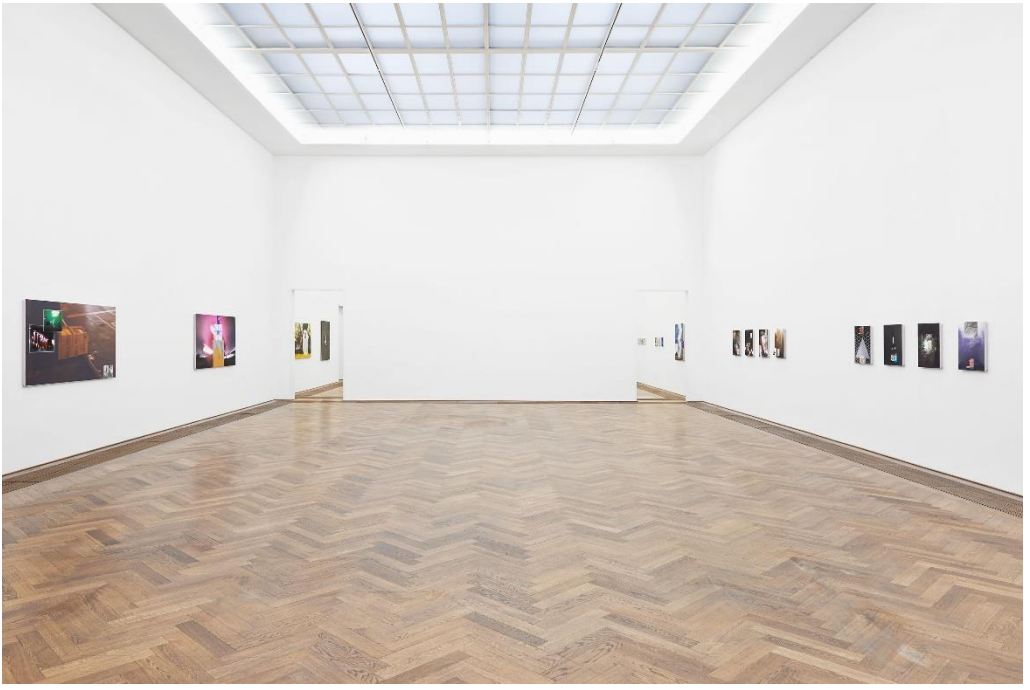
Sadie Benning, Installationsansicht Shared Eye , Kunsthalle Basel, 2017. Foto: Philipp Hänger / Sadie Benning, installation view Shared Eye , Kunsthalle Basel, 2017. Photo: Philipp Hänger

Bildlegenden müssen folgende Information beinhalten: Sadie Benning, Shared Eye , Kunsthalle Basel, 2017. Foto: Philipp Hänger