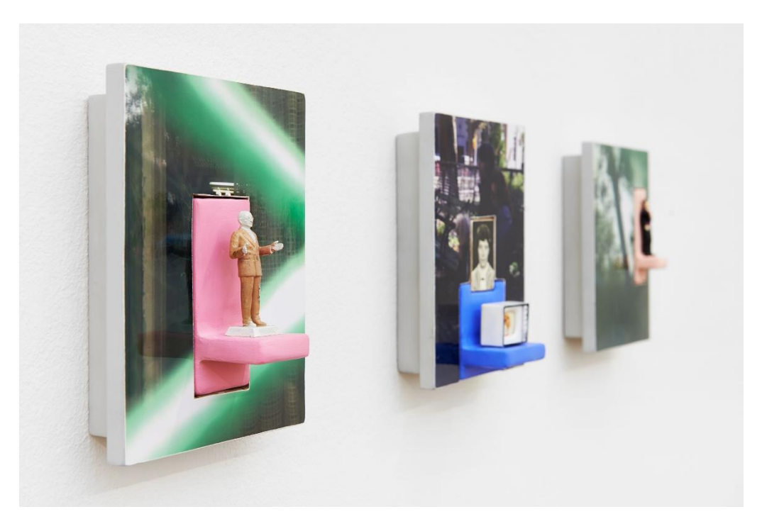
Sadie Benning, Installationsansicht Shared Eye , Kunsthalle Basel, 2017, vorne Shared Eye ( Sequence 3, Panel 8 ), 2016. Foto: Philipp Hänger / Sadie Benning, installation view Shared Eye , Kunsthalle Basel, 2017, in front Shared Eye ( Sequence 3, Panel 8 ), 2016. Photo: Philipp Hänger