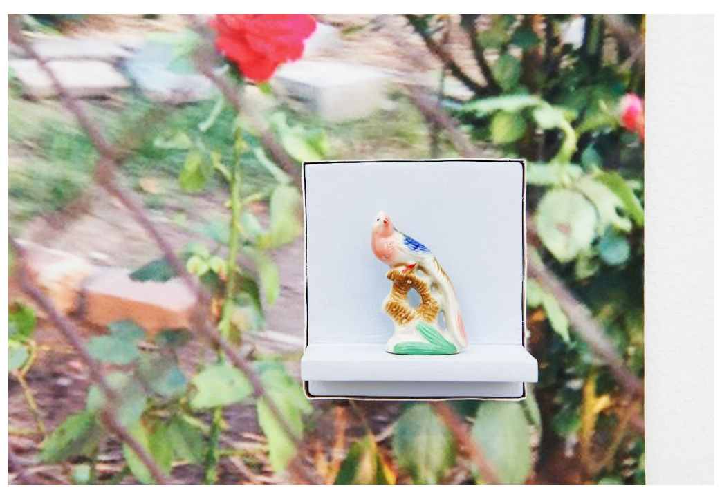
Sadie Benning, Garden , 2016 (Detail). Foto: Philipp Hänger / Sadie Benning, Garden , 2016 (detail). Photo: Philipp Hänger

Sadie Benning, Installationsansicht Shared Eye , Kunsthalle Basel, 2017, Blick auf (v.l.n.r.) Umbrella , 2016, und Stones , 2016. Foto: Philipp Hänger / Sadie Benning, installation view Shared Eye , Kunsthalle Basel, 2017, view on (f.l.t.r.) Umbrella , 2016, and Stones , 2016. Photo: Philipp Hänger