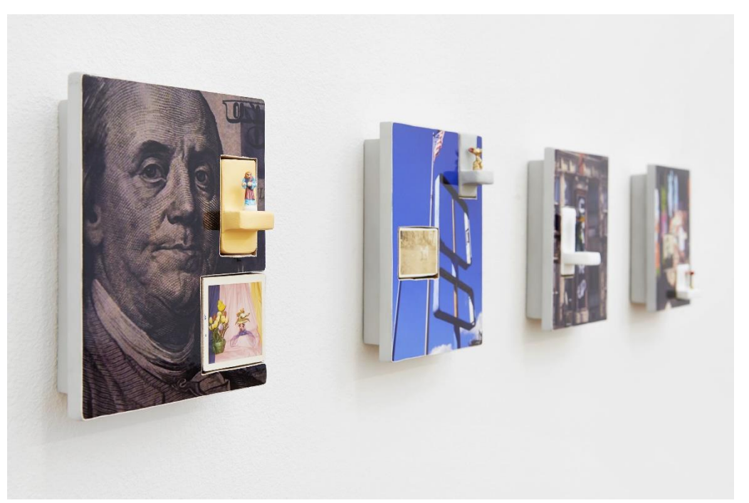
Sadie Benning, Installationsansicht Shared Eye , Kunsthalle Basel, 2017, vorne Shared Eye (Sequence 4, Panel 9), 2016. Foto: Philipp Hänger / Sadie Benning, installation view Shared Eye , Kunsthalle Basel, 2017, in fornt Shared Eye (Sequence 4, Panel 9), 2016. Photo: Philipp Hänger