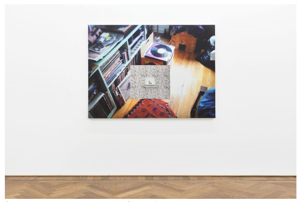
Sadie Benning, Installationsansicht Shared Eye , Kunsthalle Basel, 2017, Blick auf Bedroom , 2016. Sadie Benning, installation view Shared Eye , Kunsthalle Basel, 2017, view on Bedroom , 2016.