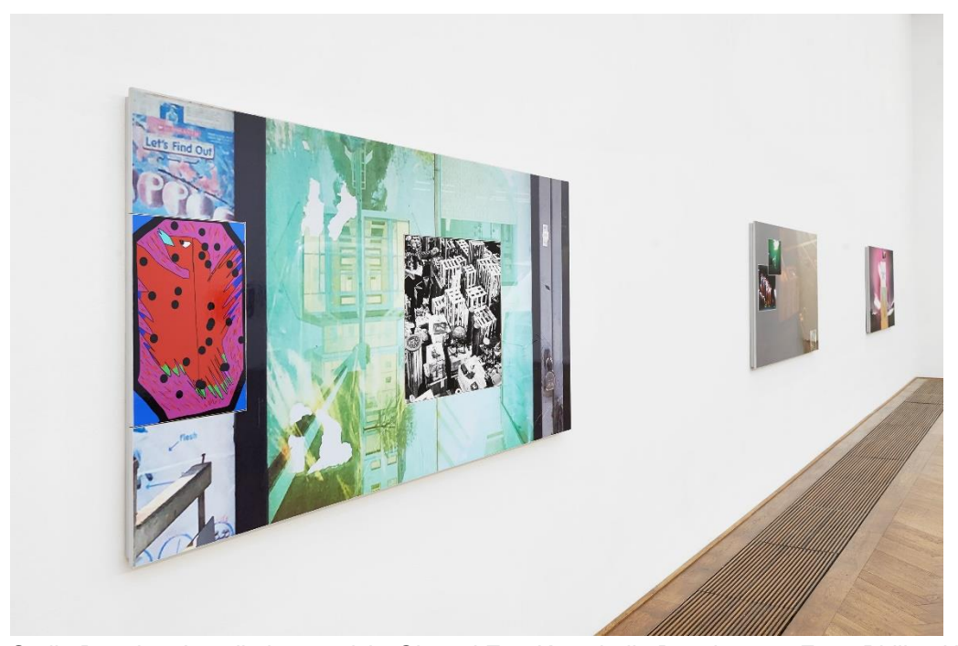
Sadie Benning, Installationsansicht Shared Eye , Kunsthalle Basel, 2017. Foto: Philipp Hänger / Sadie Benning, installation view Shared Eye , Kunsthalle Basel, 2017. Photo: Philipp Hänger