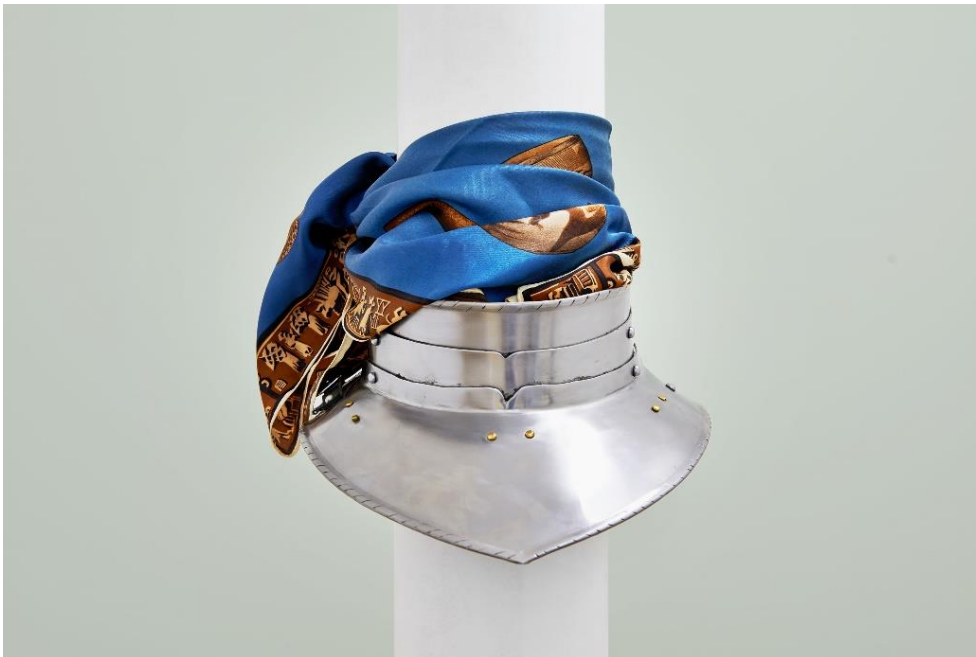
Maria Loboda, Installationsansicht Havoc in the Heavenly Kingdom , Kunsthalle Basel, 2017, Blick auf Young Warrior in the Landscape Watching the Birds Go By (Pastoral) , 2017. Foto: Philipp Hänger / Maria Loboda, installation view Havoc in the Heavenly Kingdom , Kunsthalle Basel, 2017, view on Young Warrior in the Landscape Watching the Birds Go By (Pastoral) , 2017. Photo: Philipp Hänger