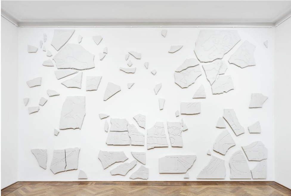
Maria Loboda, Installationsansicht Havoc in the Heavenly Kingdom , Kunsthalle Basel, 2017, Blick auf Two Idiots Engaged in a Game of Chess , 2017. Foto: Philipp Hänger / Maria Loboda, installation view Havoc in the Heavenly Kingdom , Kunsthalle Basel, 2017, view on Two Idiots Engaged in a Game of Chess , 2017. Photo: Philipp Hänger