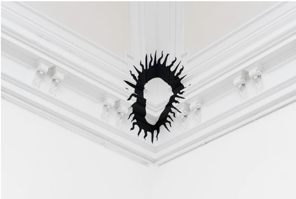
Maria Loboda, Installationsansicht Havoc in the Heavenly Kingdom , Kunsthalle Basel, 2017, Blick auf Raw Material Coming from Heaven , 2017. Foto: Philipp Hänger / Maria Loboda, installation view Havoc in the Heavenly Kingdom , Kunsthalle Basel, 2017, view on Raw Material Coming from Heaven , 2017. Photo: Philipp Hänger