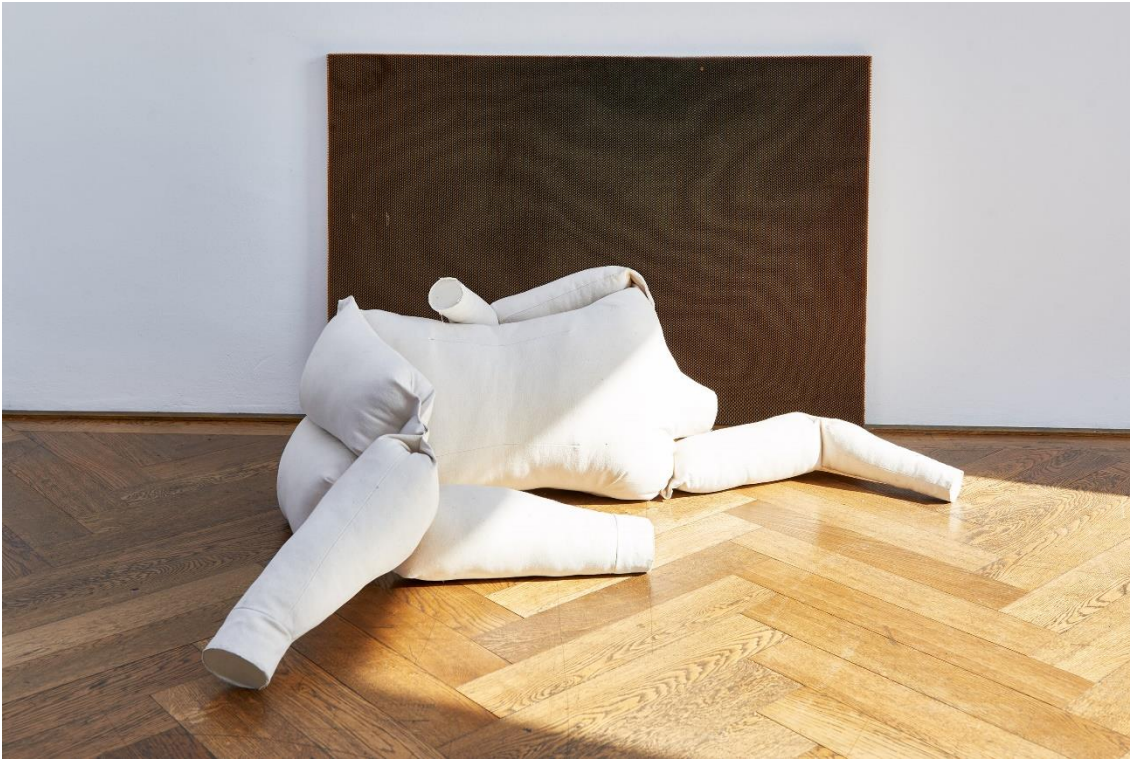
Shahryar Nashat, Installationsansicht, The Cold Horizontals , Blick auf, Player , 2017, Kunsthalle Basel, 2017.