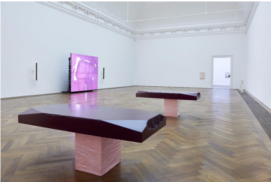
Shahryar Nashat, Installationsansicht, The Cold Horizontals , Kunsthalle Basel, 2017.