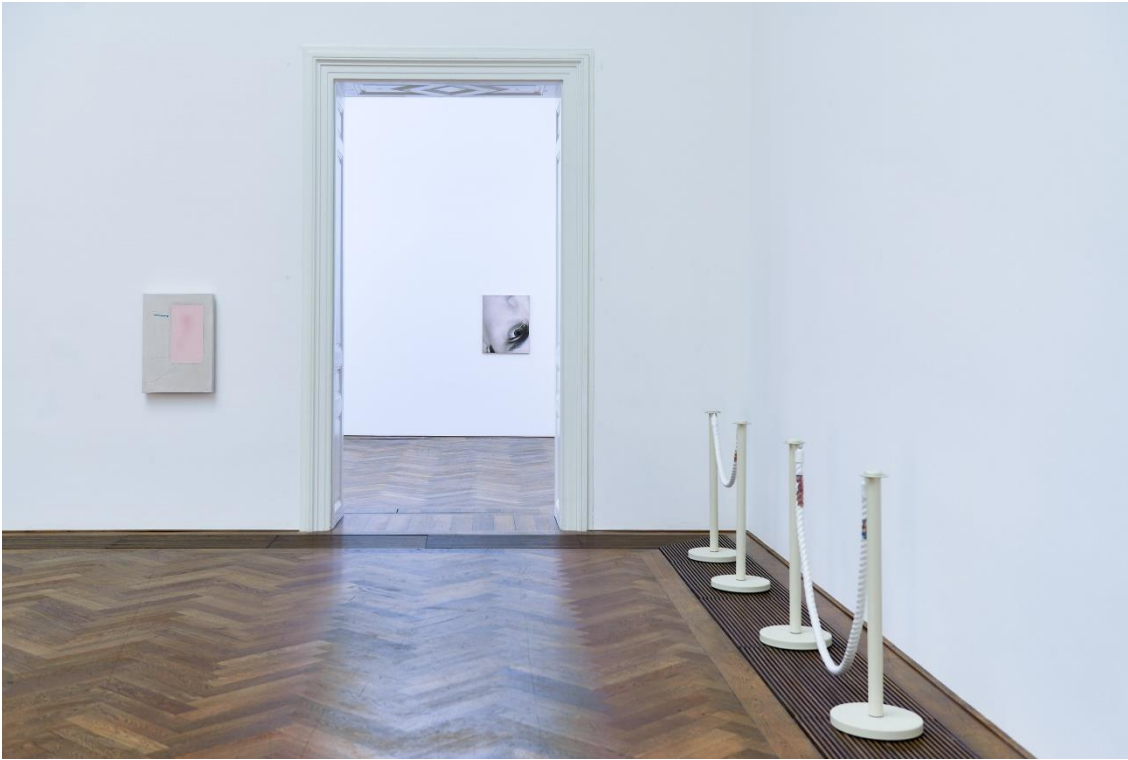
Shahryar Nashat, Installationsansicht, The Cold Horizontals , Kunsthalle Basel, 2017.