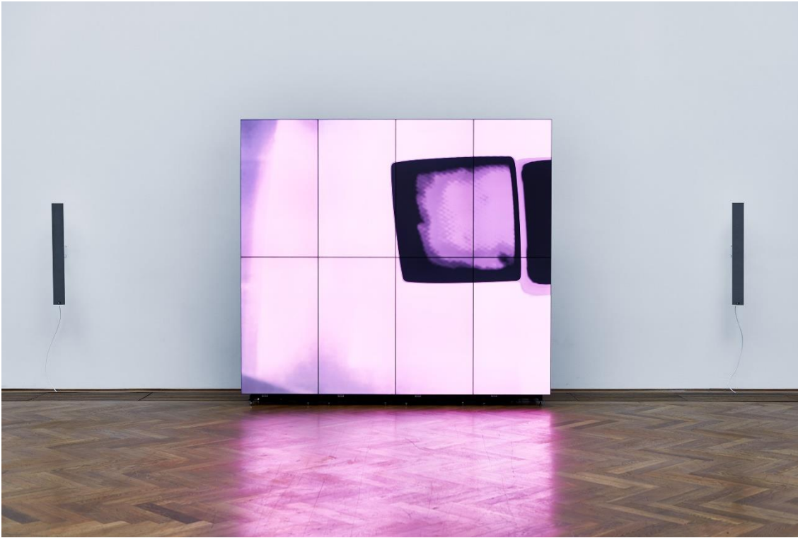
Shahryar Nashat, Installationsansicht, The Cold Horizontals , Blick auf, Image Is an Orphan , 2017, Kunsthalle Basel, 2017.