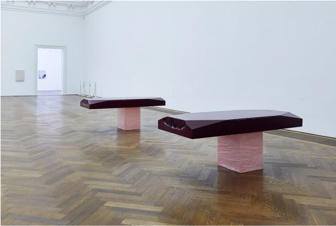
Shahryar Nashat, Installationsansicht, The Cold Horizontals , Kunsthalle Basel, 2017.