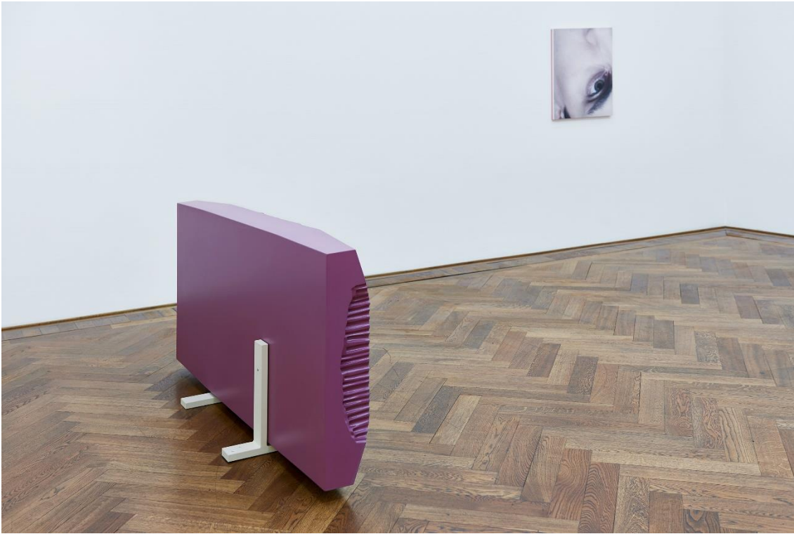
Shahryar Nashat, Installationsansicht, The Cold Horizontals , Blick auf, Cold Horizontal (GHOST) , 2017 (vorne) und After-Effects of the Tear (RAW IMAGE) , 2017 (hinten), Kunsthalle Basel, 2017.