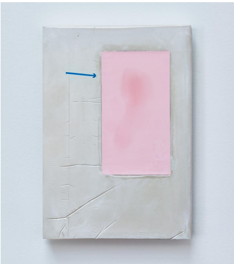
Shahryar Nashat, Installationsansicht, The Cold Horizontals , Blick auf, Yea High (for Hunter's Right Shoulder) , 2016, Kunsthalle Basel, 2017.