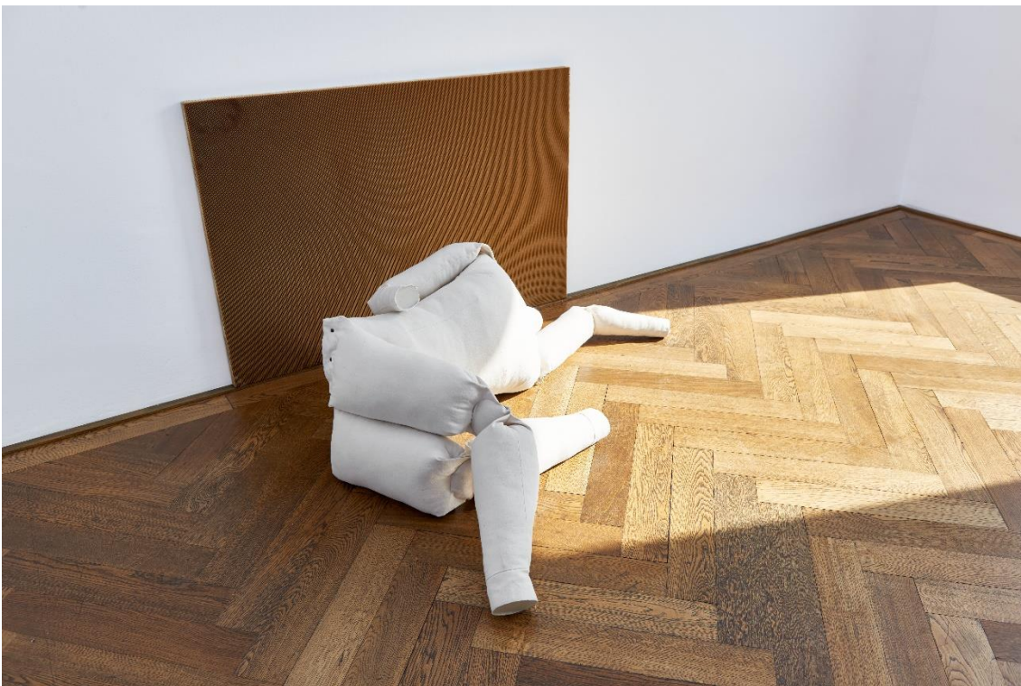
Shahryar Nashat, Installationsansicht, The Cold Horizontals , Blick auf, Player , 2017, Kunsthalle Basel, 2017.