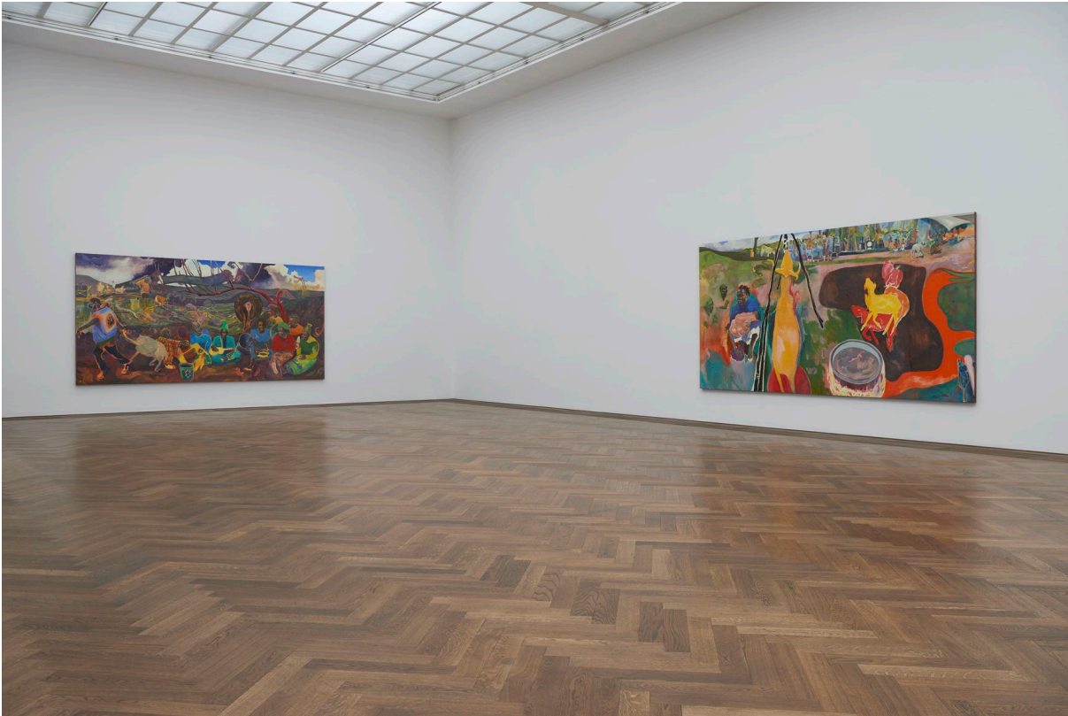
Installationsansicht, Michael Armitage, You, Who Are Still Alive, Kunsthalle Basel, 2022, Blick (v. l. n. r.) auf, Dandora (Xala, Musicians), 2022, und, Amongst the Living, 2022. Installation view, Michael Armitage, You, Who Are Still Alive, Kunsthalle Basel, 2022, view (f. l. t. r.) on, Dandora (Xala, Musicians), 2022, and, Amongst the Living, 2022.