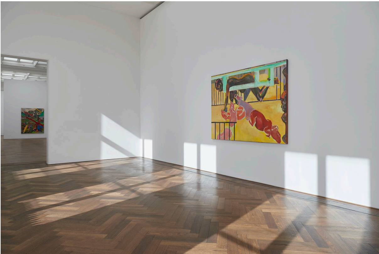
Installationsansicht, Michael Armitage, You, Who Are Still Alive , Kunsthalle Basel, 2022, Blick auf, Mother's Milk , 2022. Installation view, Michael Armitage, You, Who Are Still Alive , Kunsthalle Basel, 2022, view on, Mother's Milk , 2022.