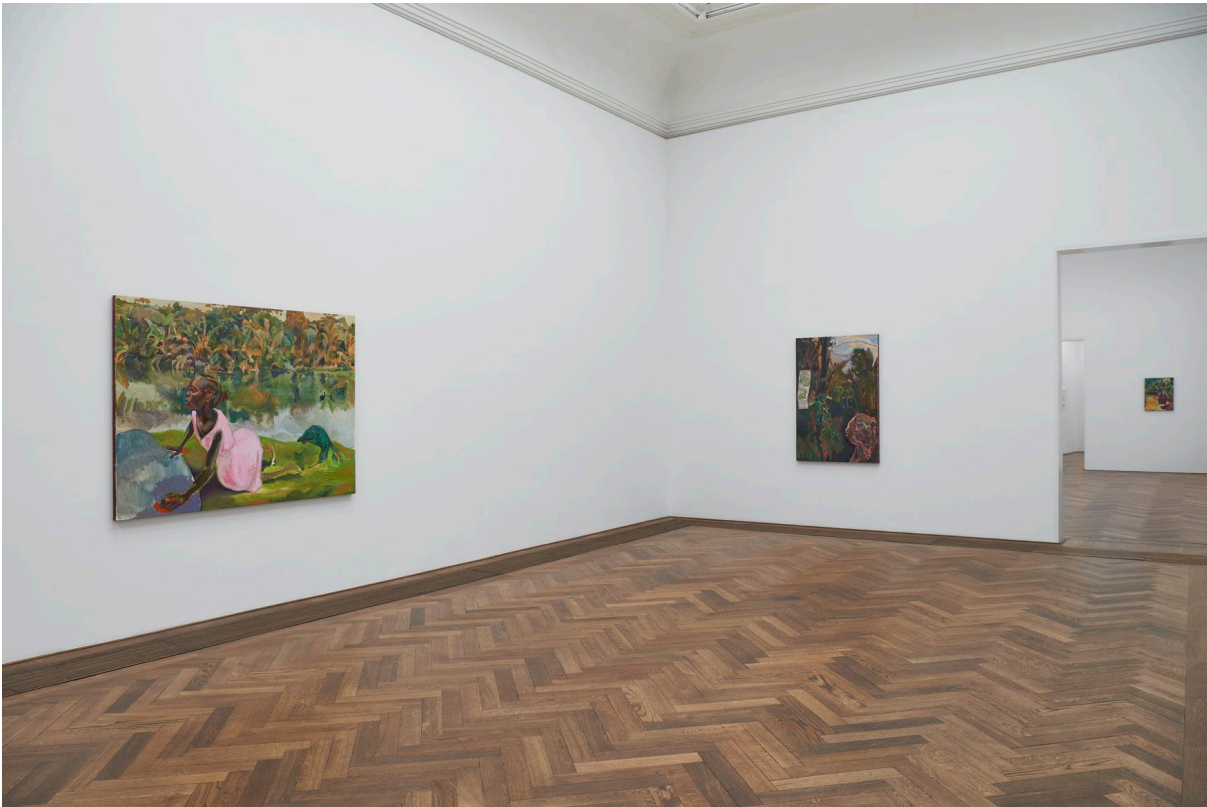
Installationsansicht, Michael Armitage, You, Who Are Still Alive, Kunsthalle Basel, 2022, Blick (v. l. n. r.) auf, Warigia, 2022; Account of an Illiterate Man, 2020; Homecoming, 2021. Installation view, Michael Armitage, You, Who Are Still Alive, Kunsthalle Basel, 2022, view (f. l. t. r.) on, Warigia, 2022; Account of an Illiterate Man, 2020; Homecoming, 2021.