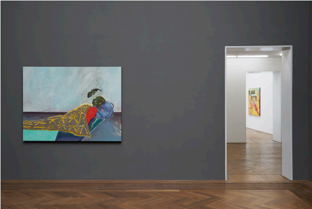
Installationsansicht, Michael Armitage, You, Who Are Still Alive , Kunsthalle Basel, 2022, Blick auf, You, Who Are Still Alive , 2022. Installation view, Michael Armitage, You, Who Are Still Alive , Kunsthalle Basel, 2022, view on, You, Who Are Still Alive , 2022.