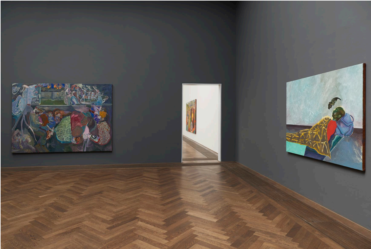
Installationsansicht, Michael Armitage, You, Who Are Still Alive , Kunsthalle Basel, 2022, Blick (v. l. n. r.) auf, Ciru (Kericho January 2008) , 2022, und, You, Who Are Still Alive , 2022. Installation view, Michael Armitage, You, Who Are Still Alive , Kunsthalle Basel, 2022, view (f. l. t. r.) on, Ciru (Kericho January 2008) , 2022, and, You, Who Are Still Alive , 2022.