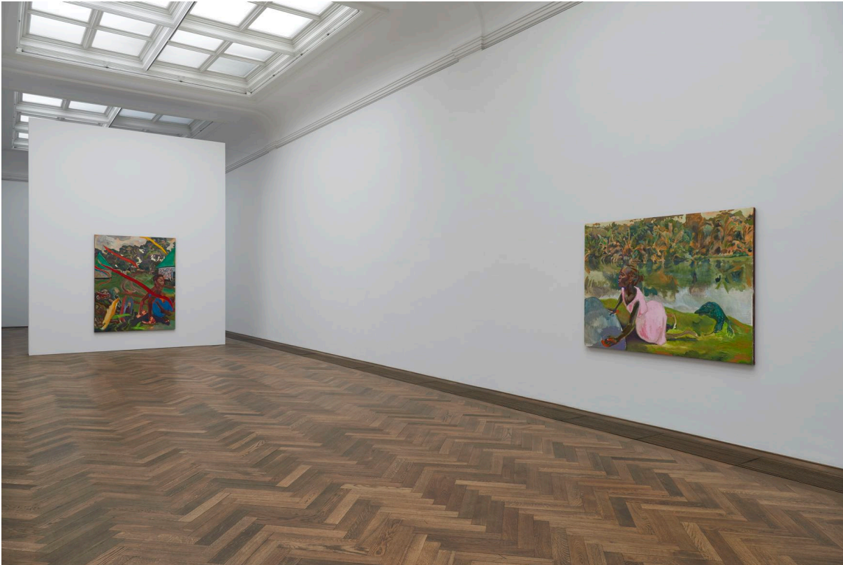
Installationsansicht, Michael Armitage, You, Who Are Still Alive, Kunsthalle Basel, 2022, Blick (v. l. n. r.) auf, The Perfect Nine, 2022, and, Warigia, 2022. Installation view, Michael Armitage, You, Who Are Still Alive, Kunsthalle Basel, 2022, view (f. l. t. r.) on, The Perfect Nine, 2022, and, Warigia, 2022.