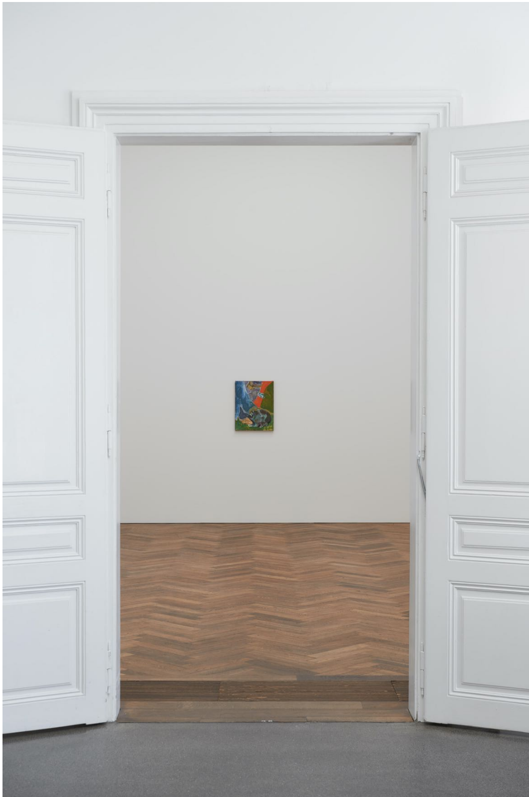
Installationsansicht, Michael Armitage, You, Who Are Still Alive, Kunsthalle Basel, 2022, Blick auf, Head of Koitalel, 2021. Installation view, Michael Armitage, You, Who Are Still Alive, Kunsthalle Basel, 2022, view on, Head of Koitalel, 2021.

Download-Link: kunsthallebasel.ch/presse/