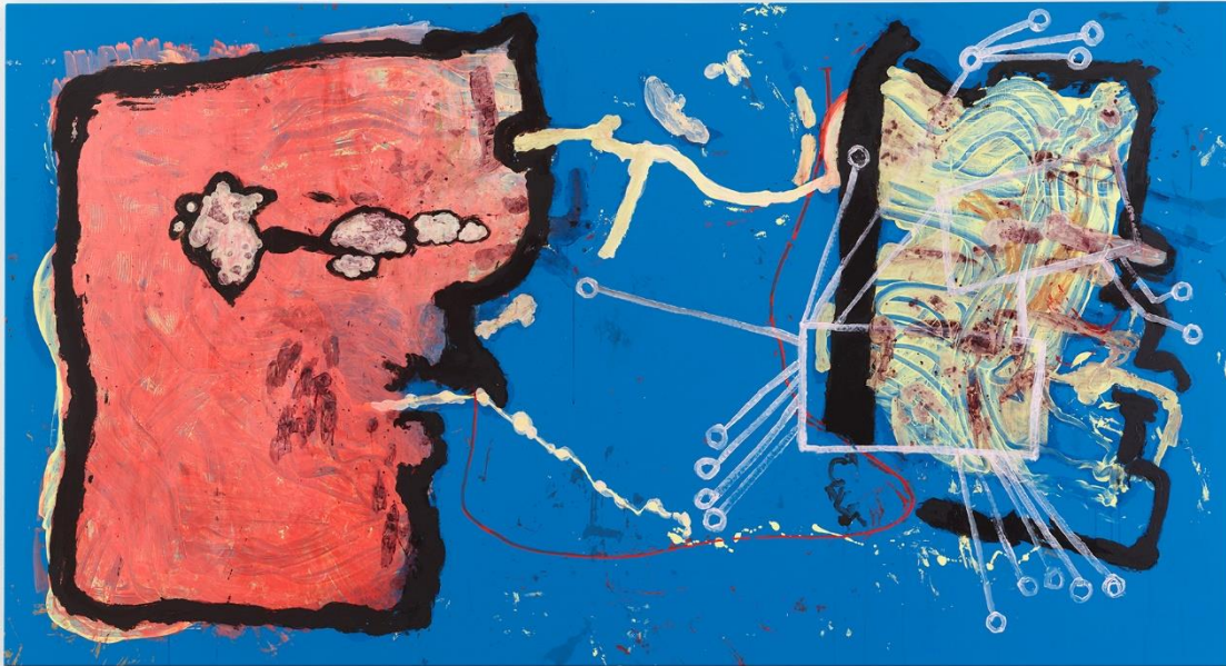
Michaela Eichwald, ohne Titel, 2019 Michaela Eichwald, untitled, 2019