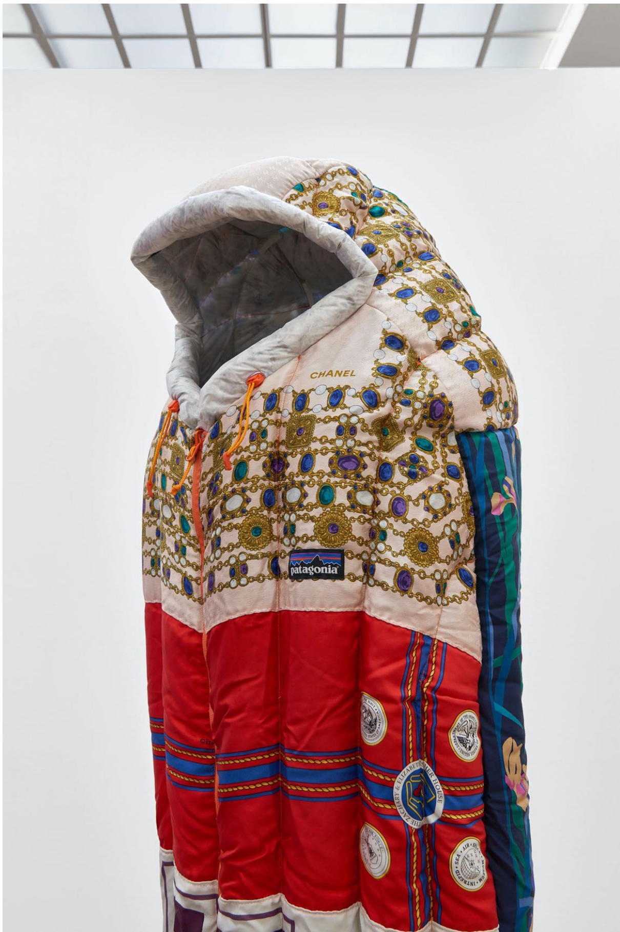
Installationsansicht, INFORMATION (Today) , Kunsthalle Basel, 2021, Detailansicht von Simon Denny, Remainder 2 , 2019.