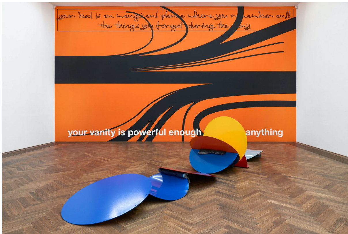
Installationsansicht, INFORMATION (Today) , Kunsthalle Basel, 2021, Blick auf Gabriel Kuri, Balance of the Invisible and the Foreseeable , 2014 (vorne) und Nora Turato, your bed is a magical place where you remember all the things you forgot during the day / your vanity is powerful enough to defeat anything , 2021 (hinten).