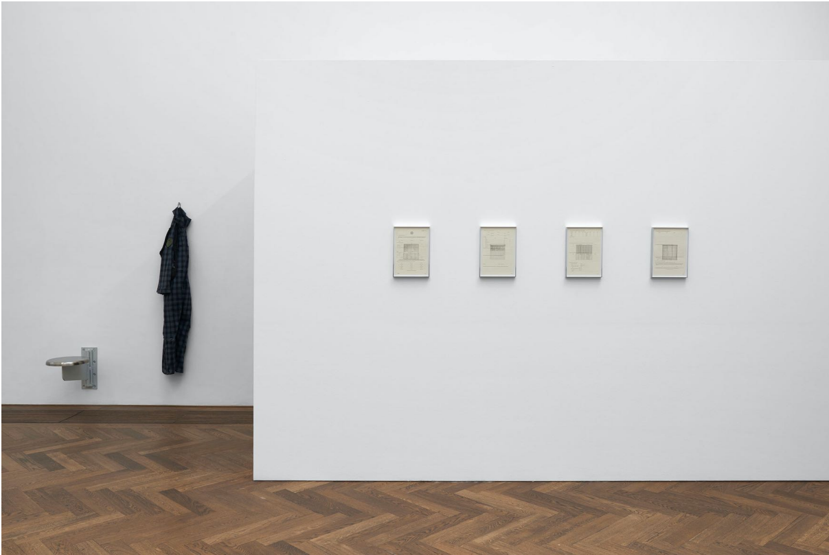
Installationsansicht, INFORMATION (Today) , Kunsthalle Basel, 2021, Blick auf Sung Tieu, Loyalty Questionnaire , 2021 (vorne) und In Cold Print , 2020 (hinten, Ausschnitt).

Installation view, INFORMATION (Today) , Kunsthalle Basel, 2021, view on Sung Tieu, Loyalty Questionnaire , 2021 (front) and In Cold Print , 2020 (back, detail).