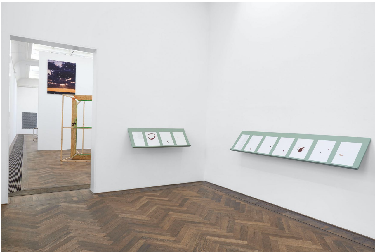
Installationsansicht, INFORMATION (Today) , Kunsthalle Basel, 2021, Blick auf Lawrence Abu Hamdan, For the Otherwise Unaccounted , 2020 (vorne).