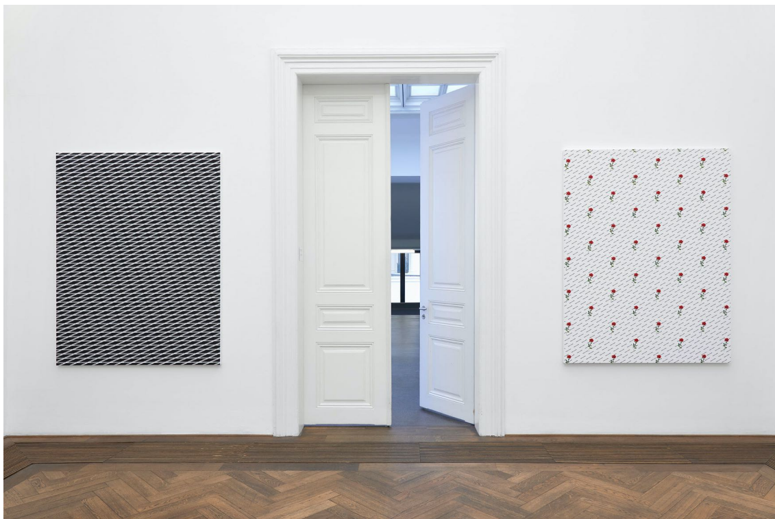
Installationsansicht, INFORMATION (Today) , Kunsthalle Basel, 2021, Blick auf Tobias Kaspar, All-over logo (black) , 2020 (links) und Logotype (red rose) , 2020 (rechts).