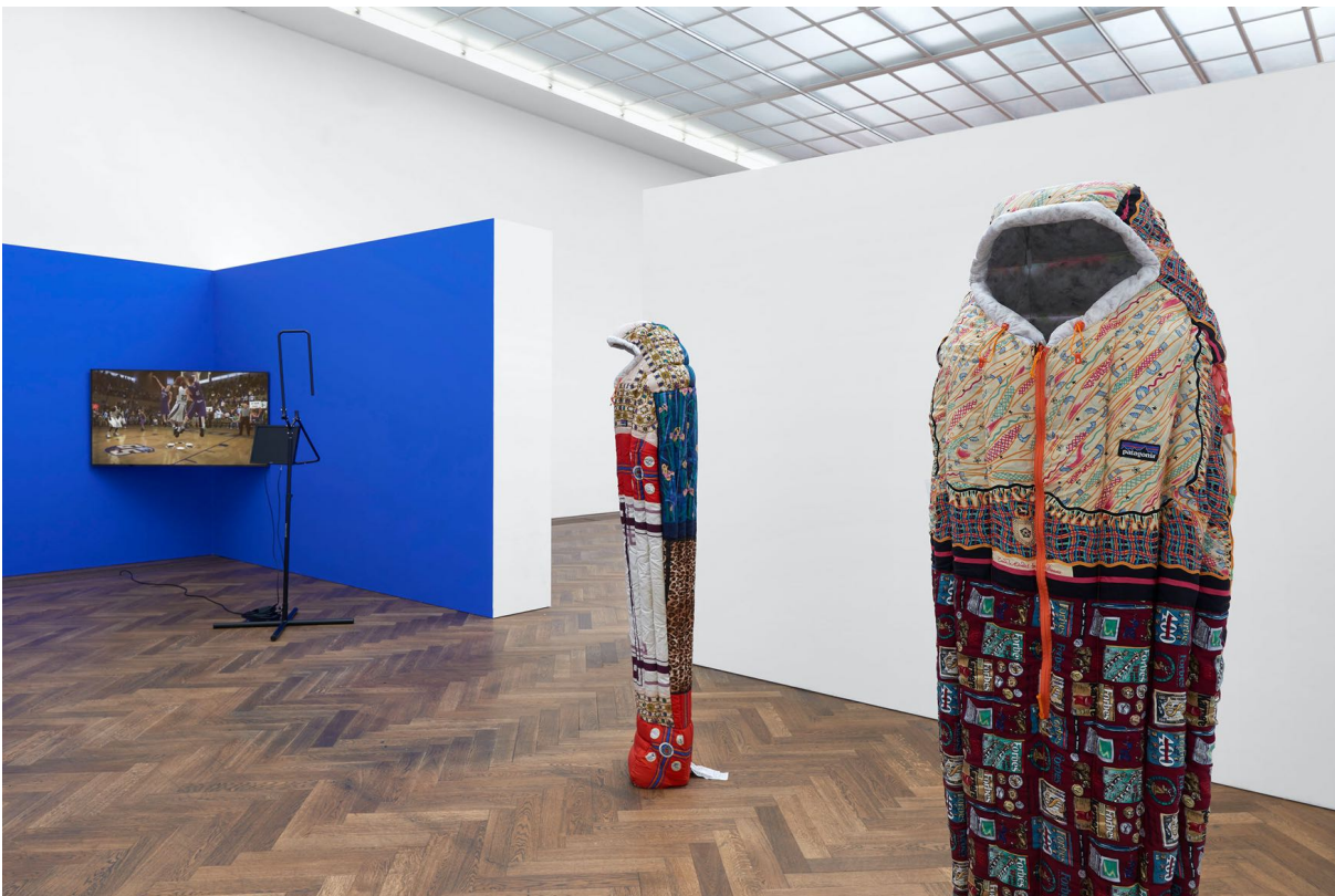
Installationsansicht, INFORMATION (Today) , Kunsthalle Basel, 2021, Blick auf Simon Denny, Remainder 1 , 2019 (rechts); Simon Denny, Remainder 2 , 2019 (mitte); Sondra Perry, IT'S IN THE GAME '18 or Mirror Gag for Projection and Three Universal Shot Trainers with Nasal Cavity, Pelvis, and Orbit , 2018 (links).

Installation view, INFORMATION (Today) , Kunsthalle Basel, 2021, view on Sung Tieu, Loyalty Questionnaire , 2021 (front) and In Cold Print , 2020 (back, detail).