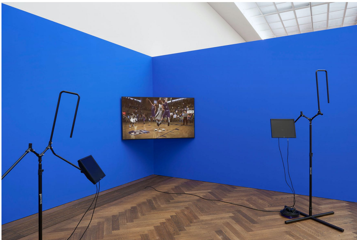
Installationsansicht, INFORMATION (Today) , Kunsthalle Basel, 2021, Blick auf Sondra Perry, IT'S IN THE GAME '18 or Mirror Gag for Projection and Three Universal Shot Trainers with Nasal Cavity, Pelvis, and Orbit , 2018.