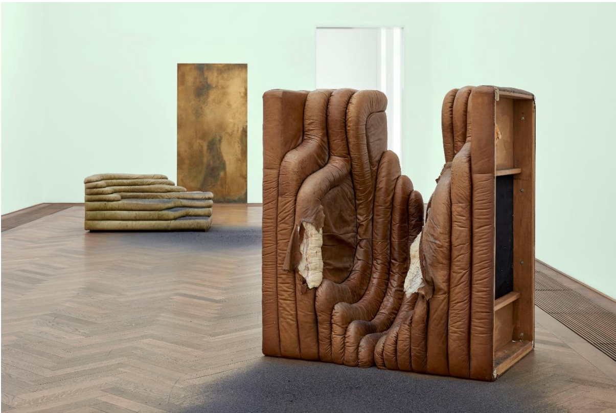
Dora Budor, Installationsansicht, I am Gong , Kunsthalle Basel, 2019. Dora Budor, installation view, I am Gong , Kunsthalle Basel, 2019.