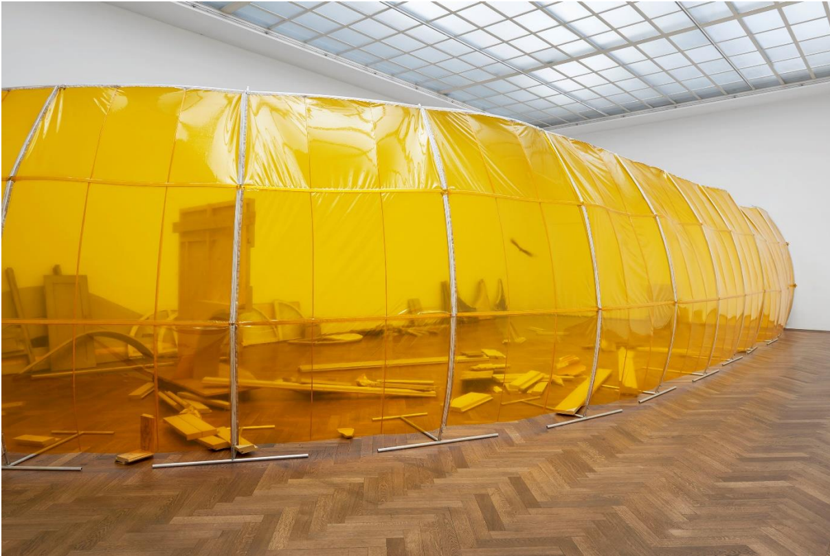
Dora Budor, Installationsansicht, I am Gong , Kunsthalle Basel, 2019, Blick auf The Preserving Machine , 2018-19. Dora Budor, installation view, I am Gong , Kunsthalle Basel, 2019, view on The Preserving Machine , 2018-19.