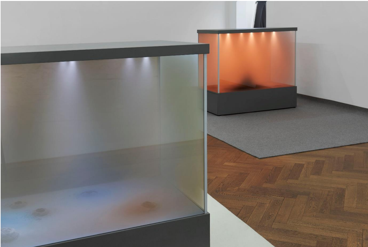
Dora Budor, Installationsansicht, I am Gong , Kunsthalle Basel, 2019, f.l.n.r. Blick auf Origin III (Snow Storm) , 2019, und Origin II (Burning of the Houses) , 2019.  Dora Budor, installation view, I am Gong , Kunsthalle Basel, 2019, f.l.t.r. view on Origin III (Snow Storm) , 2019, and Origin II (Burning of the Houses) , 2019.