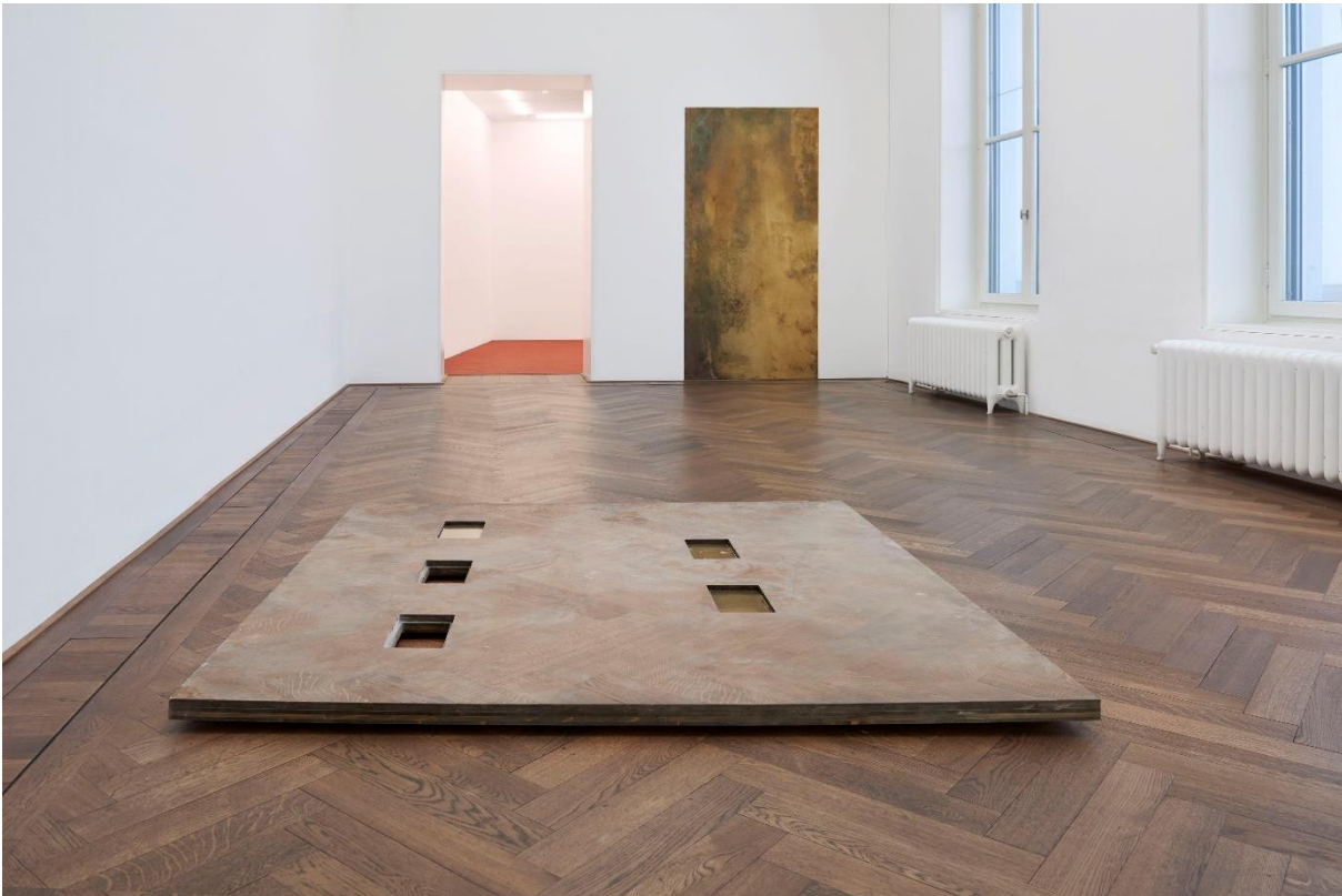
Dora Budor, Installationsansicht, I am Gong , Kunsthalle Basel, 2019, Blick auf The Devil, Probably , 2019 (vorne), und Solo for 1939 , 2019 (hinten). Dora Budor, installation view, I am Gong , Kunsthalle Basel, 2019, view on The Devil, Probably , 2019 (front), and Solo for 1939 , 2019 (back).