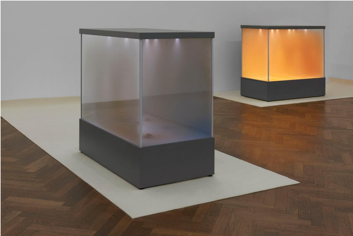
Dora Budor, Installationsansicht, I am Gong , Kunsthalle Basel, 2019, f.l.n.r. Blick auf Origin III (Snow Storm) , 2019, und Origin I (A Stag Drinking) , 2019. Dora Budor, installation view, I am Gong , Kunsthalle Basel, 2019, f.l.t.r. view on Origin III (Snow Storm) , 2019, and Origin I (A Stag Drinking) , 2019.