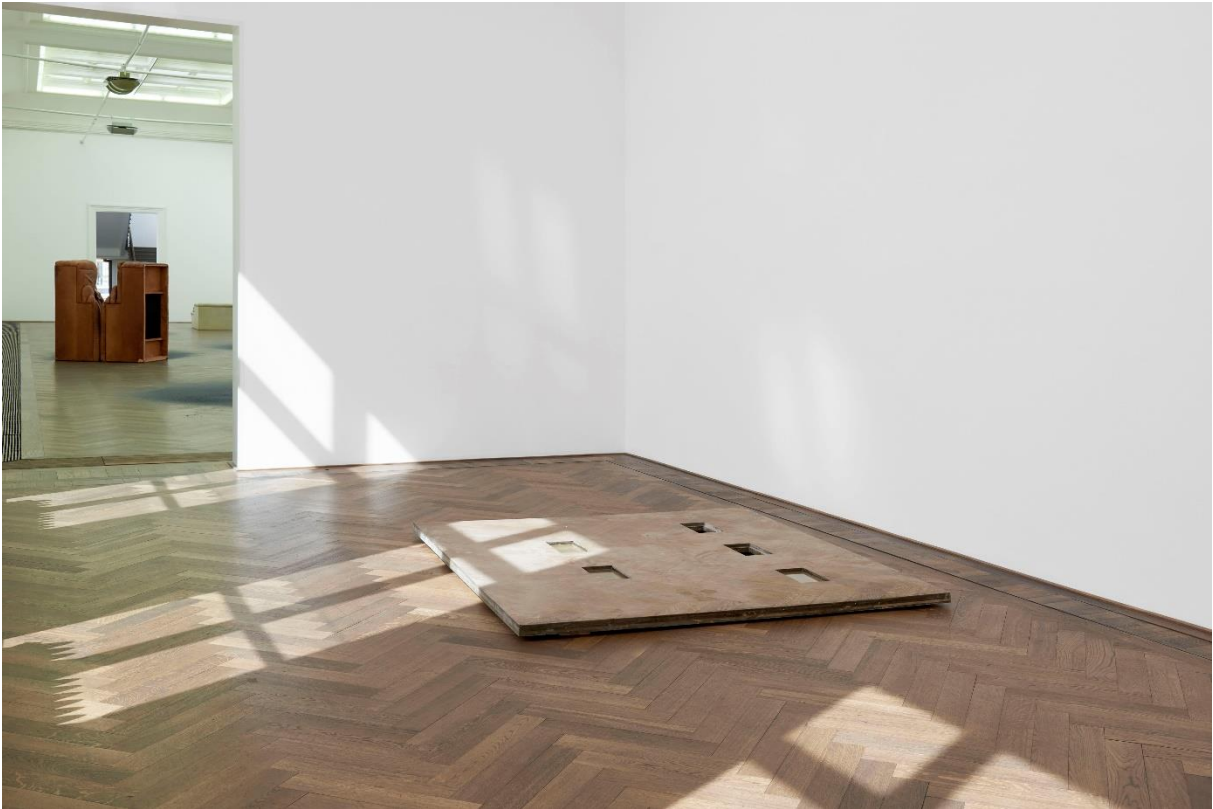
Dora Budor, Installationsansicht, I am Gong , Kunsthalle Basel, 2019. Dora Budor, installation view, I am Gong , Kunsthalle Basel, 2019.