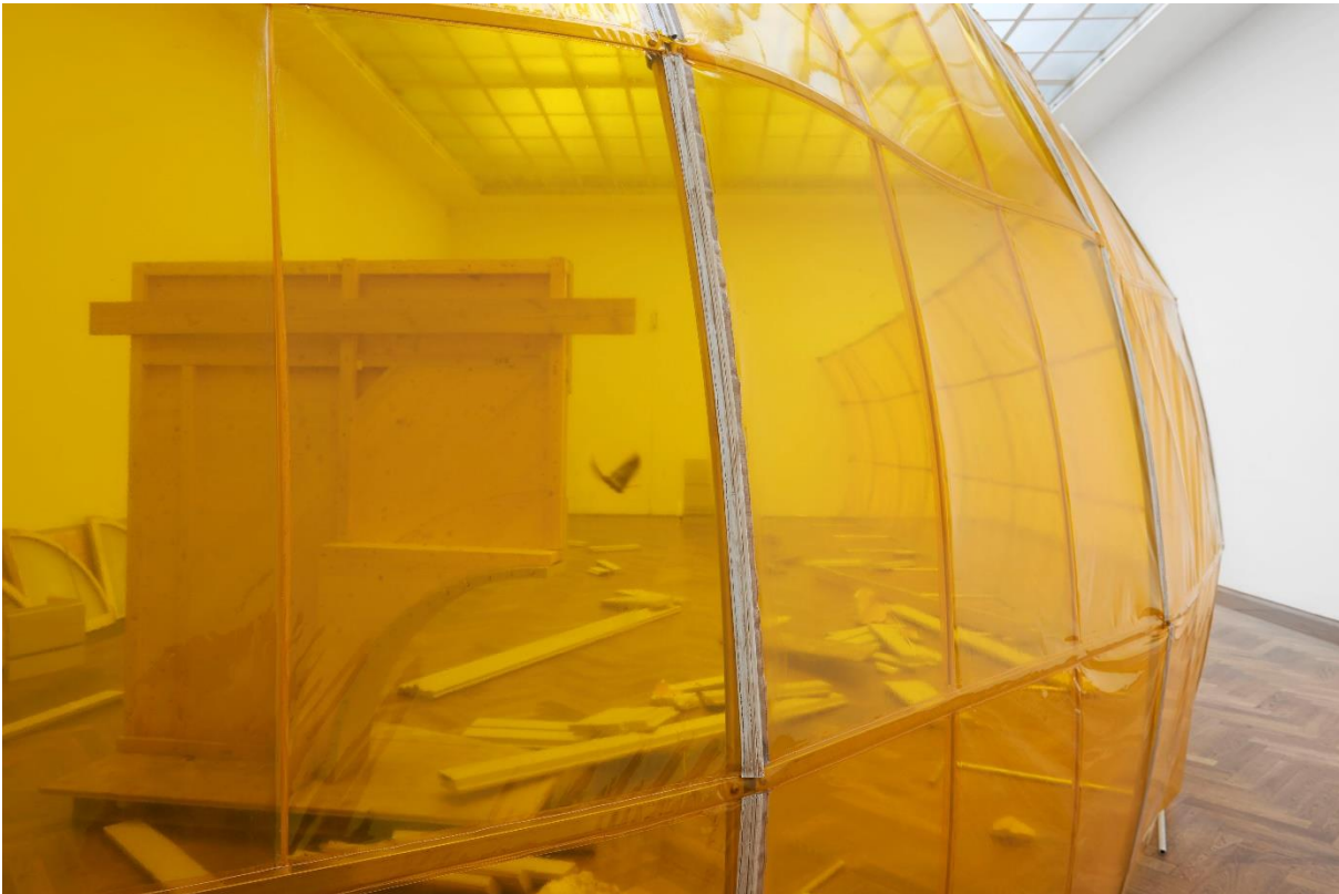
Dora Budor, Installationsansicht, I am Gong , Kunsthalle Basel, 2019, Blick auf The Preserving Machine , 2018-19. Dora Budor, installation view, I am Gong , Kunsthalle Basel, 2019, view on The Preserving Machine , 2018-19.