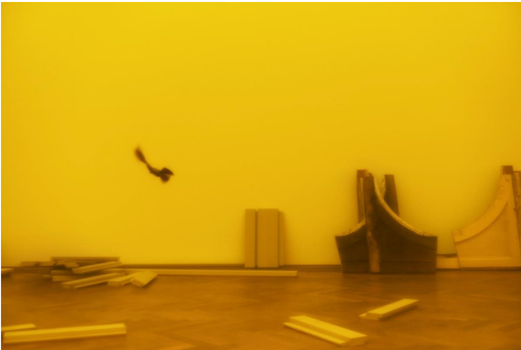
Dora Budor, Installationsansicht, I am Gong , Kunsthalle Basel, 2019, Blick auf The Preserving Machine , 2018-19, Detail.