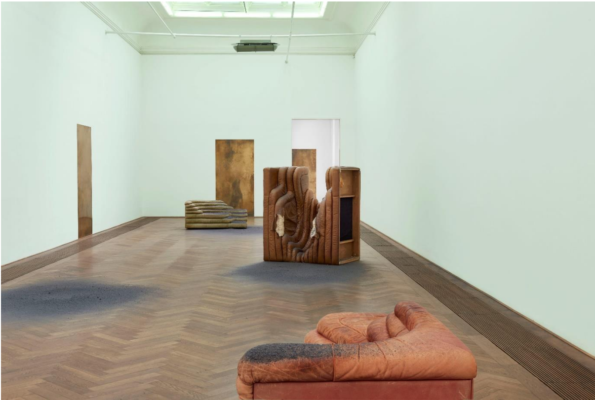
Dora Budor, Installationsansicht, I am Gong , Kunsthalle Basel, 2019. Dora Budor, installation view, I am Gong , Kunsthalle Basel, 2019.

Mehr Pressebilder finden Sie hier / Find more press images here kunsthallebasel.ch/presse/