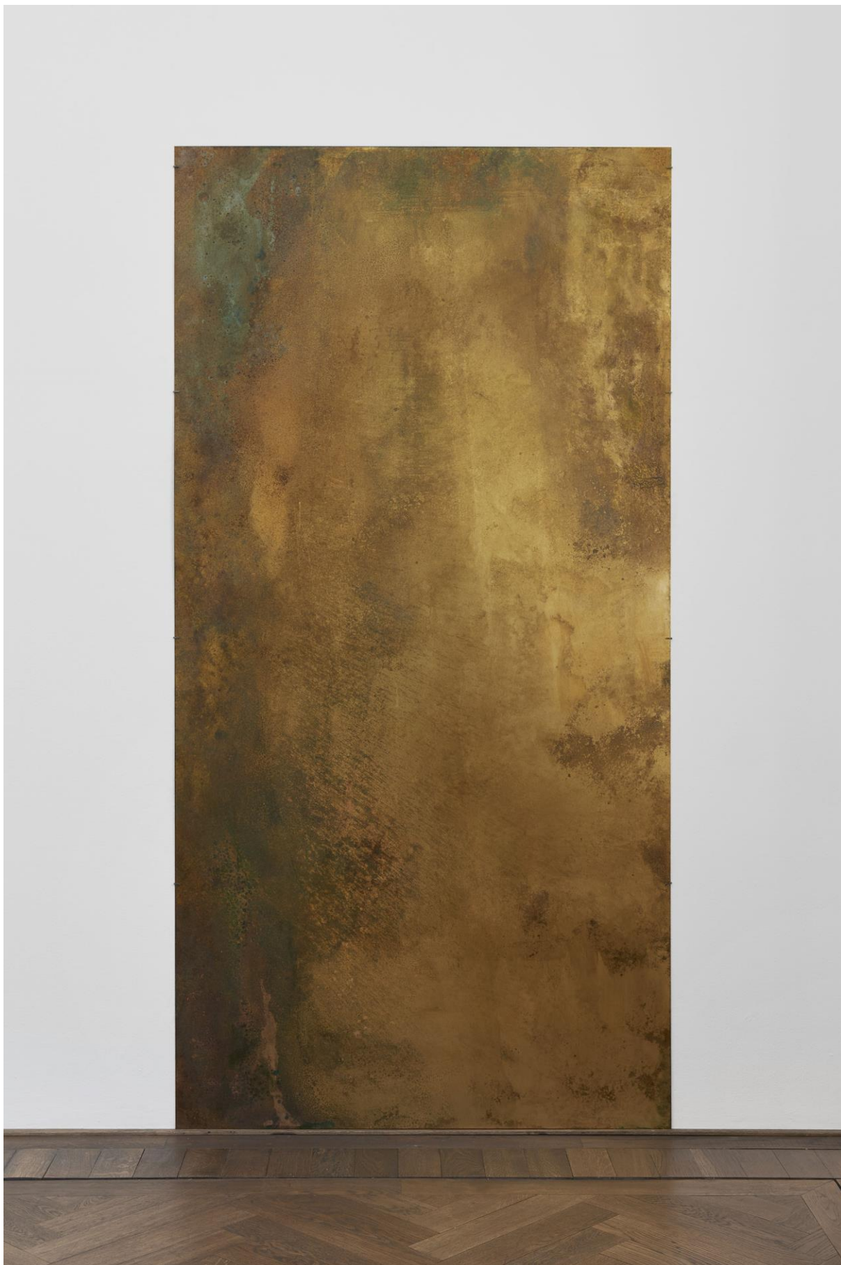
Dora Budor, Installationsansicht, I am Gong , Kunsthalle Basel, 2019, Blick auf Solo for 1939 , 2019.