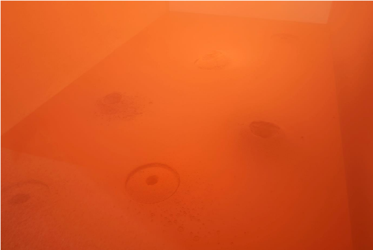
Dora Budor, Installationsansicht, I am Gong , Kunsthalle Basel, 2019, Blick auf Origin II (Burning of the Houses) , 2019 (Detail).