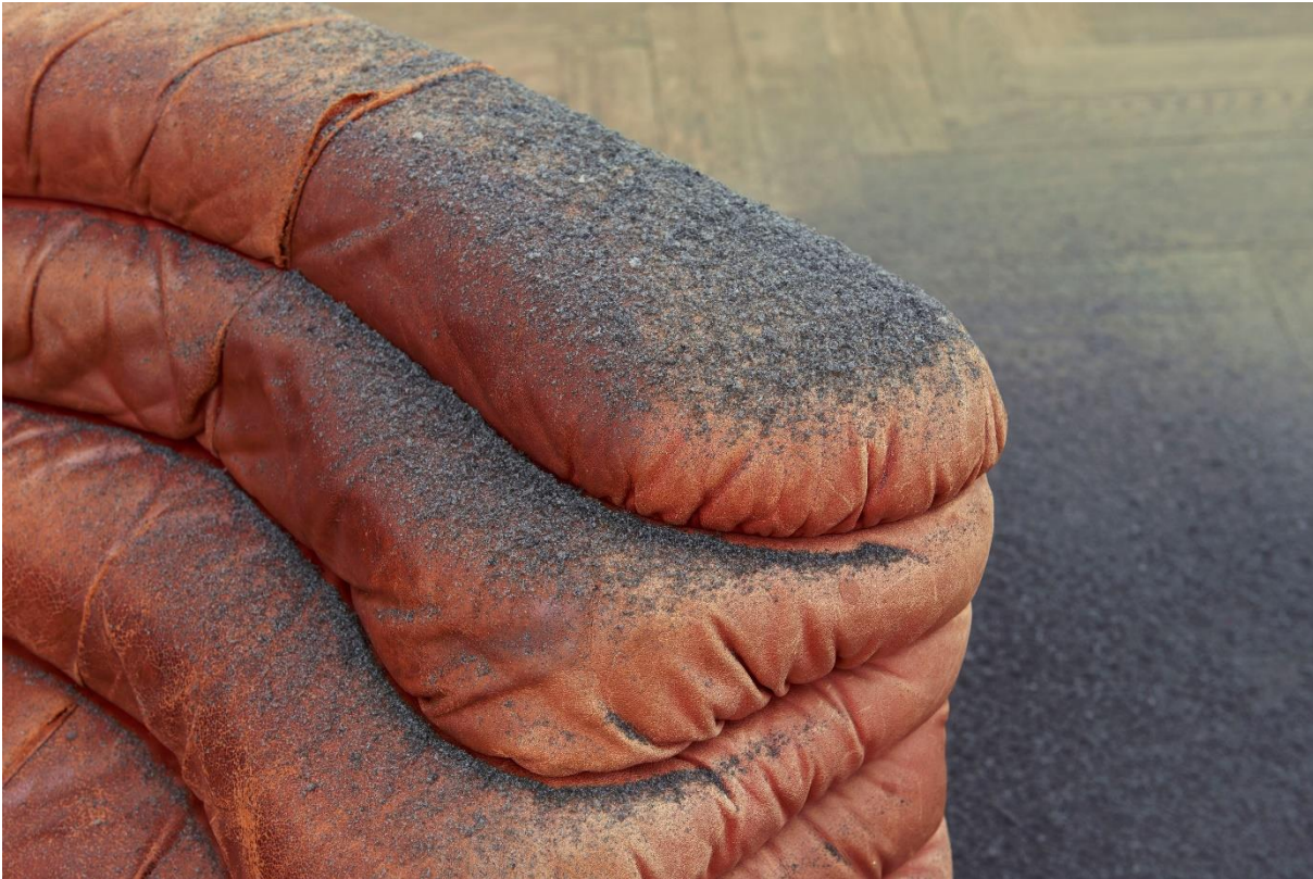
Dora Budor, Installationsansicht, I am Gong , Kunsthalle Basel, 2019, Blick auf The Year without a Summer (Klug's Field) , Detail, 2019. Dora Budor, installation view, I am Gong , Kunsthalle Basel, 2019, view on The Year without a Summer (Klug's Field) , detail, 2019.