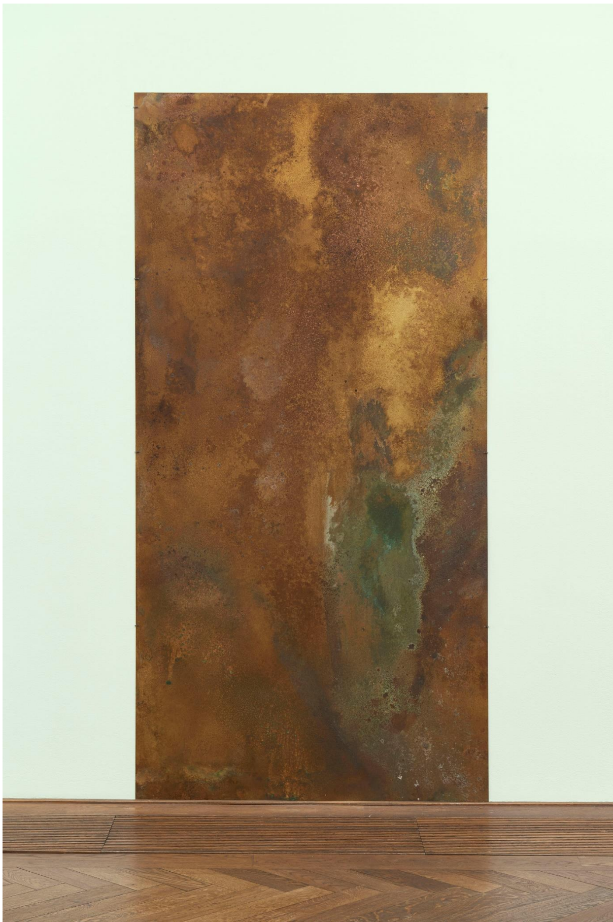
Dora Budor, Installationsansicht, I am Gong , Kunsthalle Basel, 2019, Blick auf Solo for 1876 , 2019.