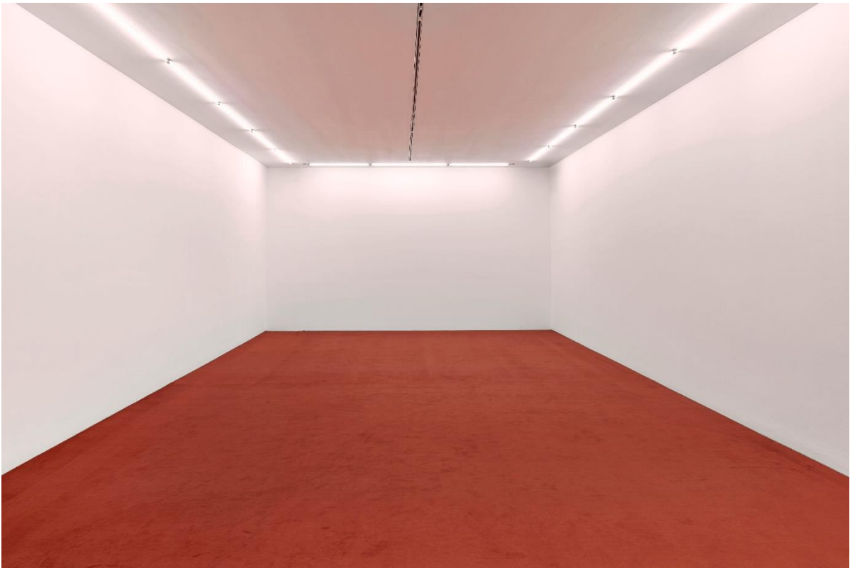
Dora Budor, Installationsansicht, I am Gong , Kunsthalle Basel, 2019. Dora Budor, installation view, I am Gong , Kunsthalle Basel, 2019.