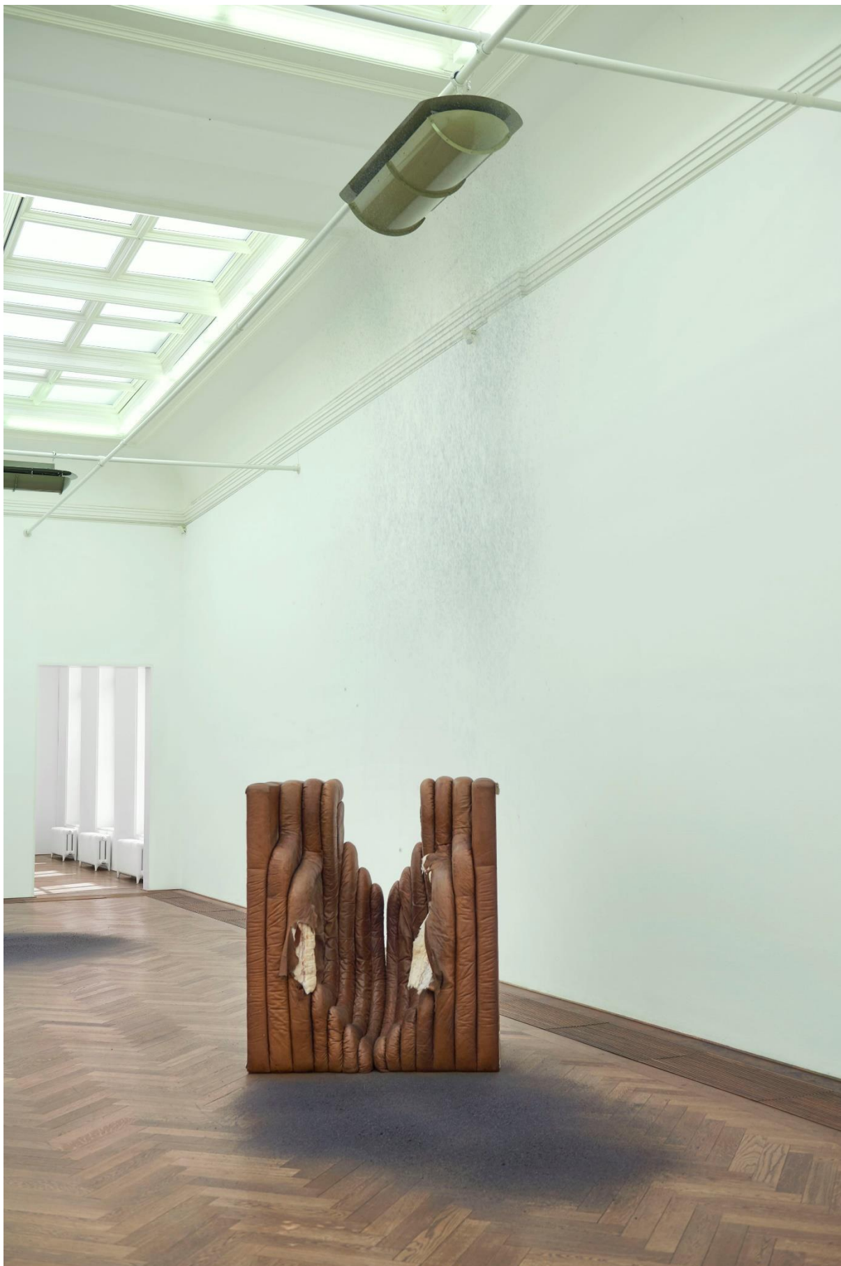
Dora Budor, Installationsansicht, I am Gong , Kunsthalle Basel, 2019, Blick auf The Year without a Summer (Klug's Field) , Detail, 2019. Dora Budor, installation view, I am Gong , Kunsthalle Basel, 2019, view on The Year without a Summer (Klug's Field) , detail, 2019.