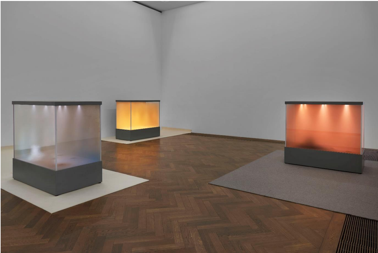
Dora Budor, Installationsansicht, I am Gong , Kunsthalle Basel, 2019, f.l.n.r. Blick auf Origin III (Snow Storm) , Origin I (A Stag Drinking) , Origin II (Burning of the Houses) , alle 2019.