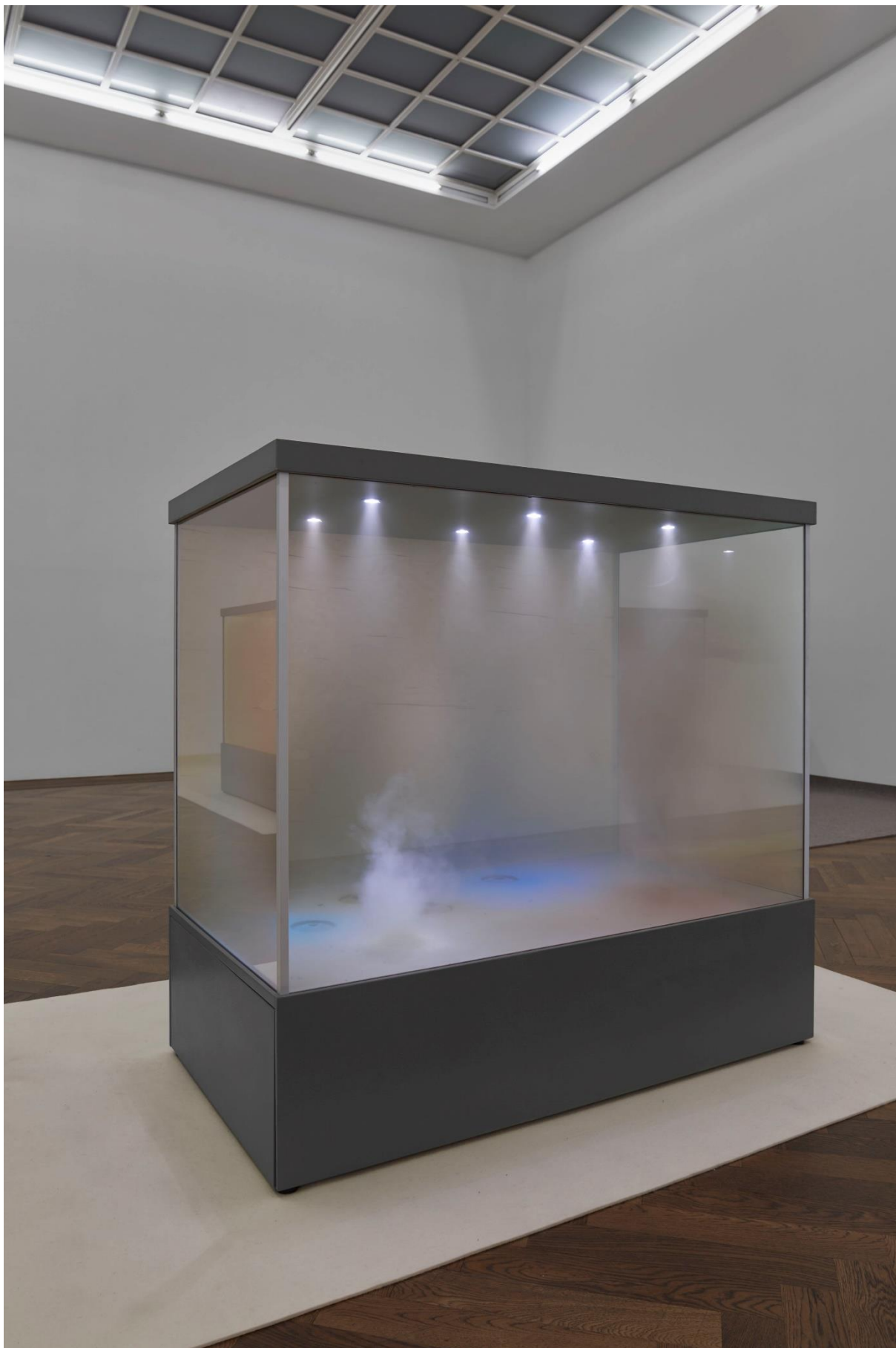
Dora Budor, Installationsansicht, I am Gong , Kunsthalle Basel, 2019, Blick auf Origin III (Snow Storm) , 2019.