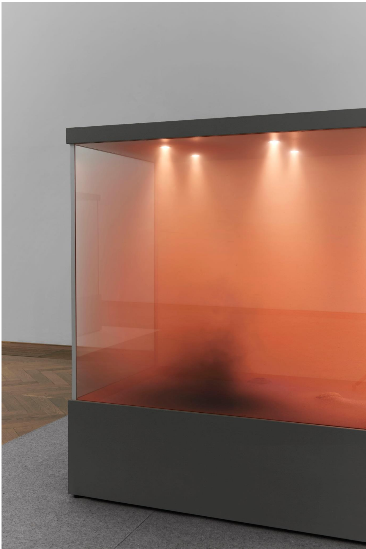
Dora Budor, Installationsansicht, I am Gong , Kunsthalle Basel, 2019, Blick auf Origin II (Burning of the Houses) , 2019.