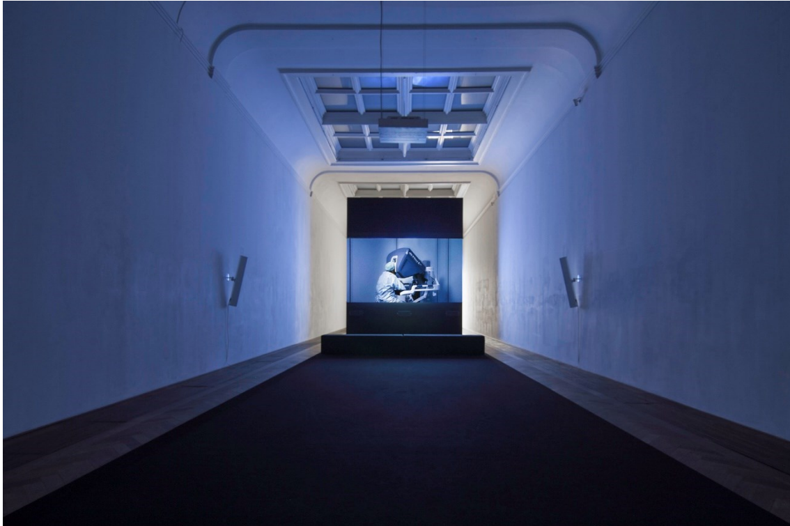
Yuri Ancarani, Installationsansicht, Sculture , Blick auf Da Vinci , 2012, Kunsthalle Basel, 2018.