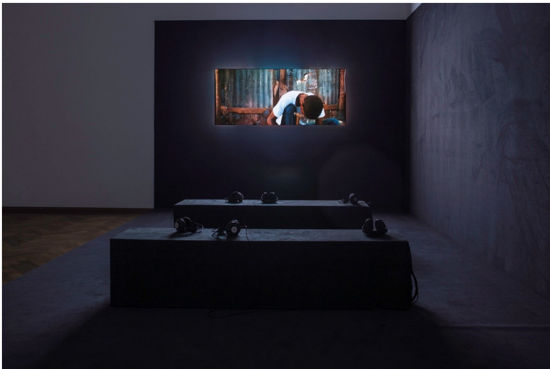
Yuri Ancarani, Installationsansicht, Sculture , Blick auf Whipping Zombie , 2017, Kunsthalle Basel, 2018.

Yuri Ancarani, installation view, Sculture , view on Whipping Zombie , 2017, Kunsthalle Basel, 2018.