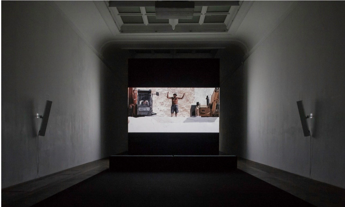
Yuri Ancarani, Installationsansicht, Sculture , Blick auf Il Capo , 2010, Kunsthalle Basel, 2018.

Download-Link kunsthallebasel.ch/presse/