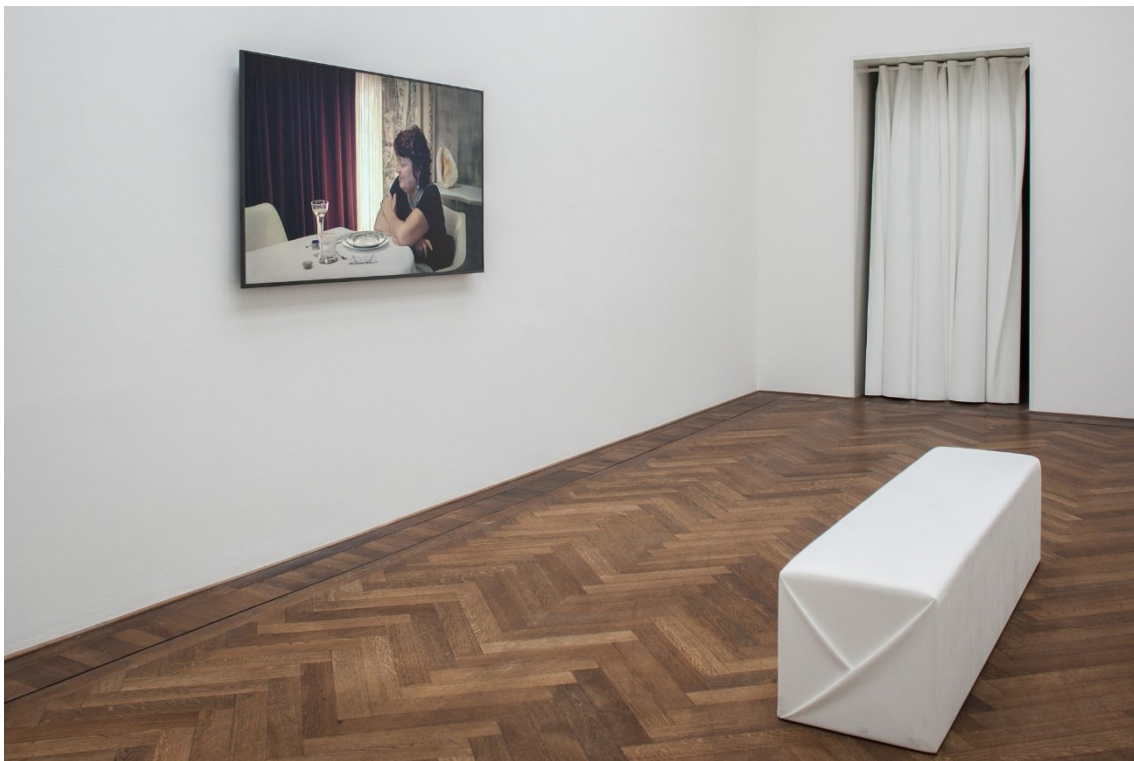
Yuri Ancarani, Installationsansicht, Sculture , Blick auf Séance , 2014, Kunsthalle Basel, 2018.