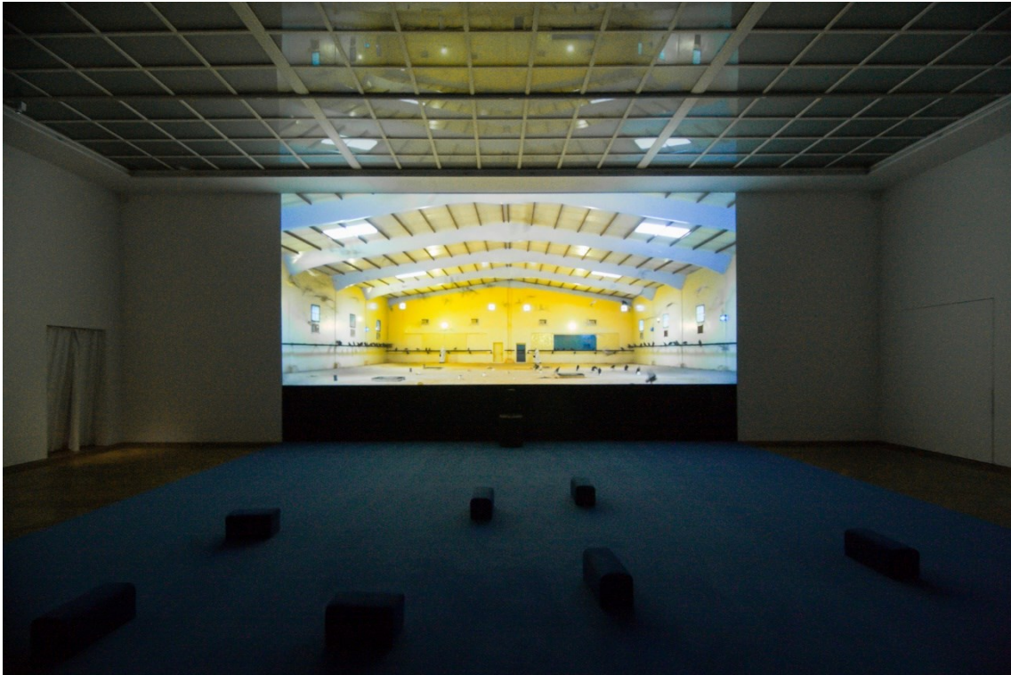
Yuri Ancarani, Installationsansicht, Sculture , Blick auf The Challenge , 2016, Kunsthalle Basel, 2018.