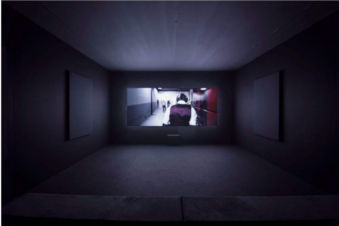
Yuri Ancarani, Installationsansicht, Sculture , Blick auf San Siro , 2014, Kunsthalle Basel, 2018.